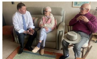
A draft proposal for a bill to establish an independent commissioner to promote and safeguard the rights and interests of older people.