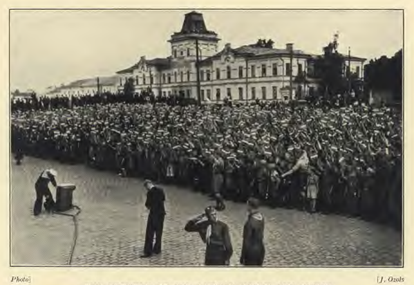
THE GREETING OF THE LATVIAN SCOUTS AND GUIDES