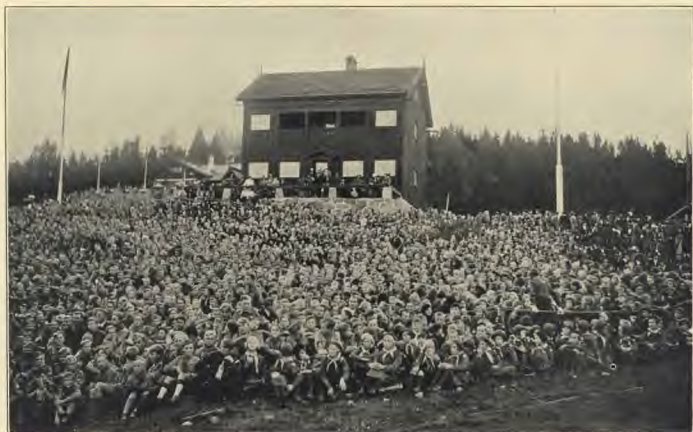
THE AUDIENCE AT THE CAMP FIRE, NORWAY