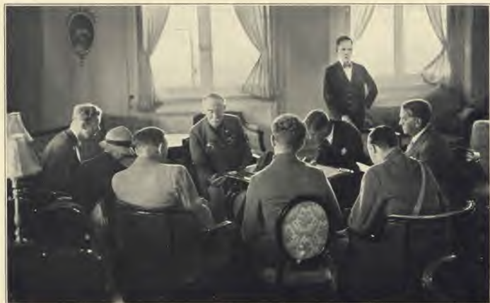
RECEPTION OF THE PRESS IN THE SHIP'S DRAWING-ROOM, NORWAY