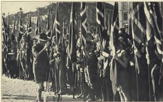
THE CHIEF SCOUT INSPECTING NORWEGIAN SCOUTS AND GUIDES