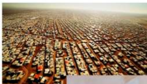
Life in the refugee camps

This is not one of the priorities contained in the LOIP, assisting with a humanitarian crisis can't be planned for, but by working together we made a concerted effort to help. It is a huge step for families moving to a new home that is so different to their own, but it helps that this is such a welcoming community. We've had an enormous amount of help from organisations, businesses and individuals in our local community, both in the planning stages and since arrival. This is an excellent example of partnership working as, without the commitment of the partners and the community, Orkney would not have been able to participate in the Programme.