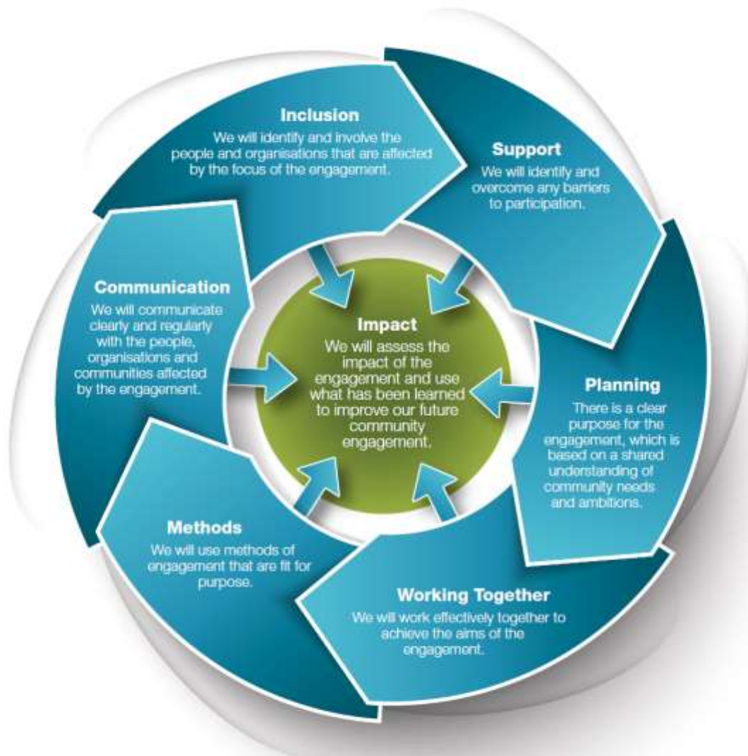
The National Standards for Community Engagement