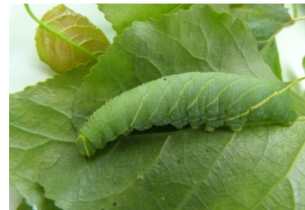
Fully grown caterpillar