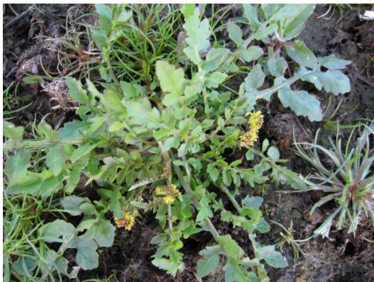
Northern Yellow-cress (John Crossley)

Northern Yellow-cress Rorippa islandica (Nationally Scarce), new for 10 km square, was found near the loch margin, but was troublesome to identify, the plants being unusually tall and upright and therefore possibly Marsh Yellow-cress R. palustris , a species not previously seen in Orkney but common further south and with a single record for Shetland. Specimens were subsequently sent to the national referee, who confirmed R. islandica . Away from the loch, White Ramping-fumitory Fumaria capreolata (Locally Scarce), new for 10 km square, and Purple Ramping-fumitory F. purpurea (Nationally Scarce and UKBAP Priority) were found in disturbed and arable ground, and Hoary Plantain Plantago media (non-native) was admired at its well-documented but sole Orkney location in the former tennis-court lawn of Graemeshall house. Northern Saltmarsh-grass Puccinellia distans subsp. borealis (Nationally Scarce) was growing on the roadside verge by the sea, new for 10 km square.