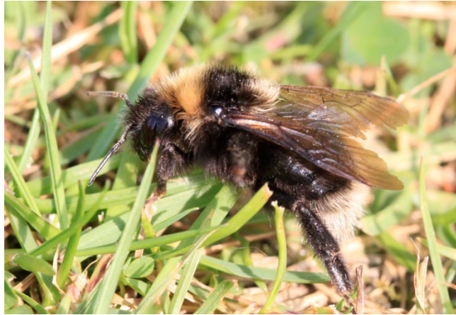
Barbut's Cuckoo Bee