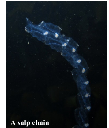
A salp chain