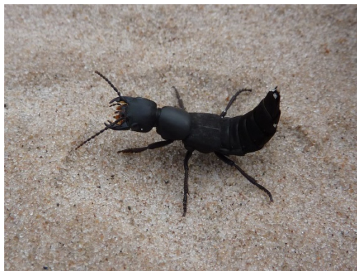
Devil's Coach Horse

Devil's Coach Horse Ocypus olens was recorded three times in 2013, in Eday and Orphir. Its slightly smaller and more colourful relative, Staphylinus erythropterus was found in Rousay, Hoy and West Mainland. This species has reddish wing-cases and spots formed by patches of yellow hair on the abdomen. The other large rove beetle in Orkney is Carrion Beetle Creophilus maxillosus , which has wing-cases marked with patches of white hairs contrasting with a very shiny thorax. It was found in Eday and Orphir.