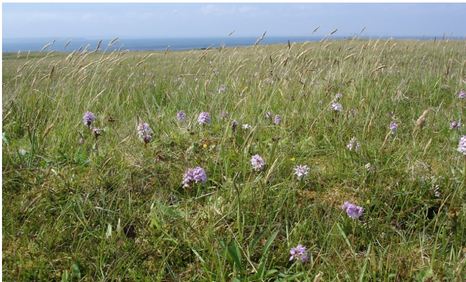
Heath Spotted-orchids, Swona