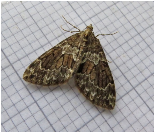
Spruce Carpet (Mary Harris)

In the following list the following abbreviations are used: