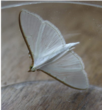
Palpita vitrealis

This report starts with two species new to Orkney: Palpita vitrealis and Spruce Carpet Thera britannica . These are followed by Other Sightings of Interest; this is only a small selection from the total of 248 species recorded in 2013, 248 being almost half the 499 species on the Orkney list.