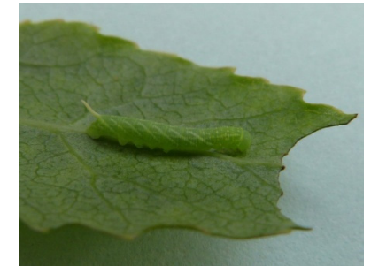
10 day old caterpillar