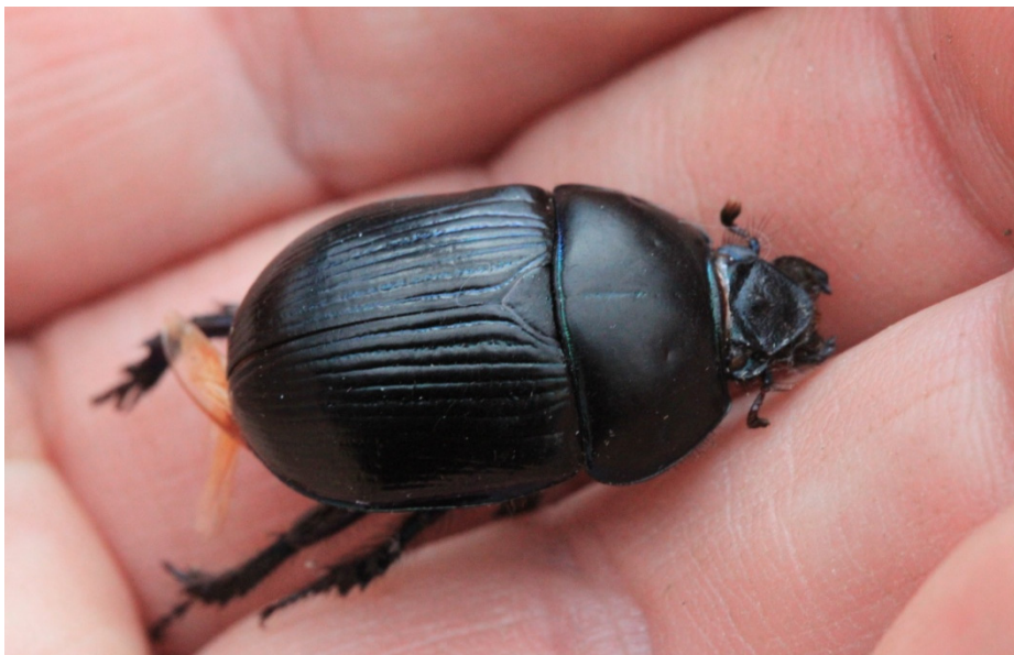
Dor Beetle – see page 40; 'Beetle Report 2013'.