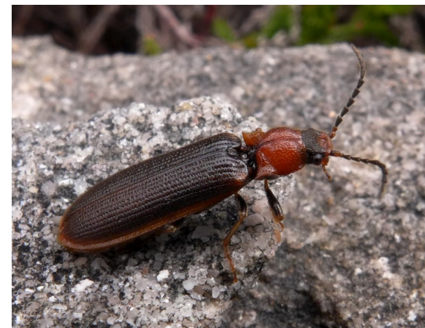
Denticollis linearis (Derek Mayes)

Denticollis linearis is a very distinctive black and orange click beetle. One was photographed in Orphir in July. It is a new species for Orkney and is unlikely to have been overlooked. It has been recorded in the middle of Caithness; some click beetles fly readily so it could have flown from around there. It was a female; males are mainly orange.