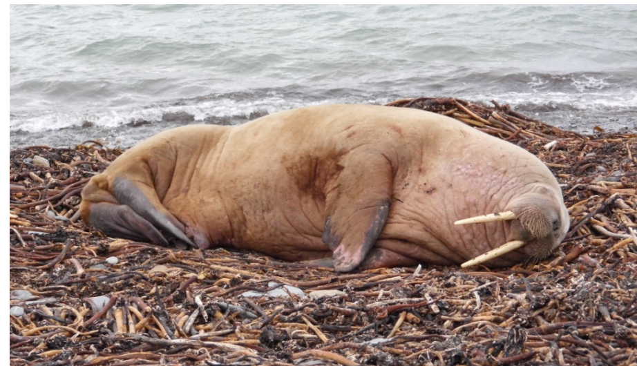
Walrus, North Ronaldsay, March 2014

Contents are the copyright of the authors and may not be reproduced without their permission. All photographs are copyright of the photographers and may not be reproduced without their permission.