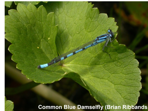
Common Blue Damsel