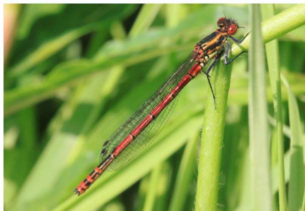
Large Red Damselfly (Brian Ribbands)

some pools in this area are not accurately marked on the OS map). Here we were in damselfly-watcher’s heaven. There were at least 120, and probably many more, Common Blue Damsels in flight over the pool or at rest on the pondweed and marginal vegetation. The scene was positively “shimmering” with damsels. Other damsels included 13 Emerald and 10 Large Red Pyrrosoma nymphula . Dragons were also present –