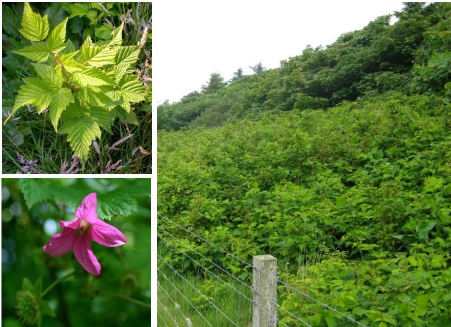
Salmonberry thicket; foliage and flower