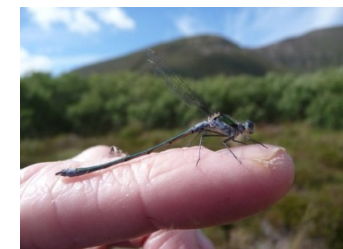
Left - Meadow Grasshopper Above - Emerald Damselfly See pages 13-15; 'Hoy Dragons'.