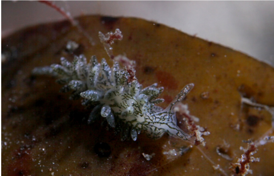
Placida dentrica (Anne Bignall) – see page 20; 'Houton Slugs'.