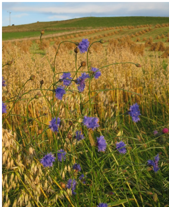
Cornflowers, South Ronaldsay

Hemp Cannabis sativa , Gaitnip, St Ola, HY4406, 2005 (AB). In grass re-seed. Second County record (last in 1933), new for 10 km square.