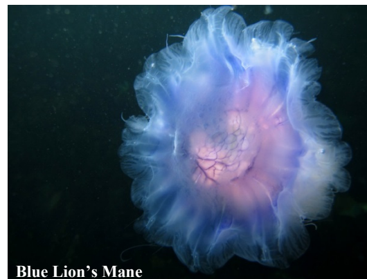
Blue Lion's Mane