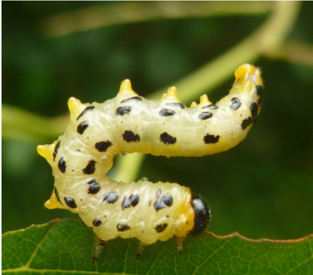
Craesus septentrionalis larva, in defensive pose (Jenni Stockan)

Craesus septentrionalis was first recorded from Orkney on Hoy in 1977. It has been found in relatively large numbers in Sandwick in 2010, 2011 and 2013 on alder and whitebeam. Last year it was also seen in Stenness on birch and in Orphir on alder. This species has the potential to be widespread as it uses numerous host plants and the larvae feed gregariously. The adults have characteristically swollen tarsi so field identification is possible. Adults are on the wing during early June in Orkney and larvae have been found from the end of June through July until pupation in mid-August.