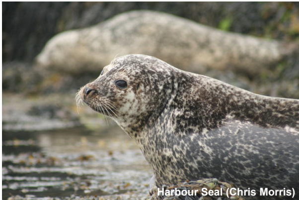
Harbour Seal (Chris Morris)

It's a quiet morning in Orkney. I am looking outside the window at the sunrise. It's a day in mid-summer. Where I come from in Norway the sun never sets at this time of year. Inside the hostel Hannah and I are about to head out and start the day. The ocean tide is at its lowest in a few hours and we need to be ready when the seals haul out. I am here to collect scat samples from Harbour (Common) Seals Phoca vitulina to study natural