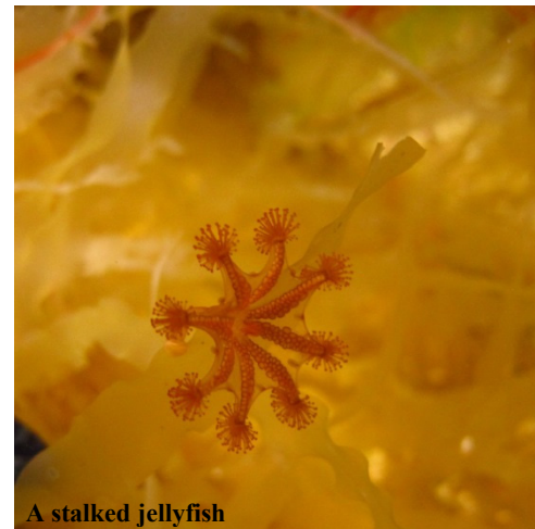
A stalked jellyfish