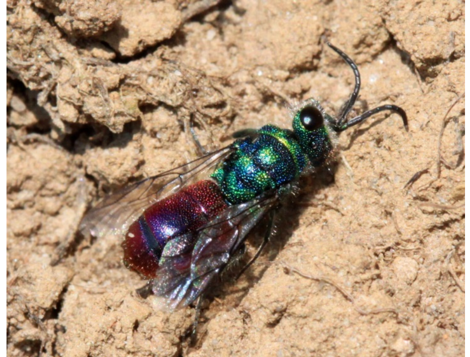
Ruby-tailed Wasp

There was a single report from Birsì Geo, South Walls on 7 July, new for 10 km square ND38 (JBR).