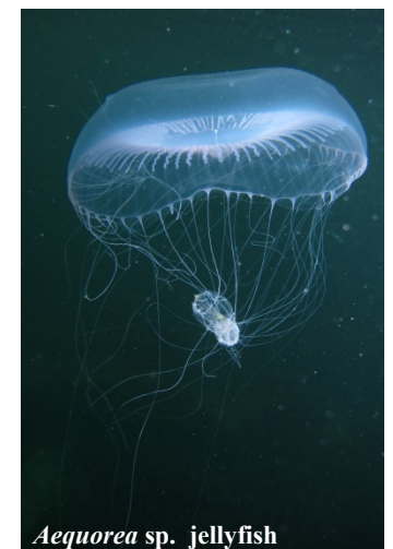
Aequorea sp. jellyfish