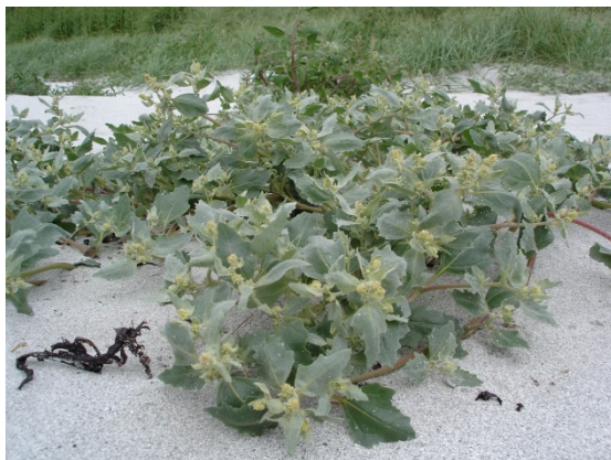
Frosted Orache

With these records this species becomes Locally Scarce instead of Locally Rare.