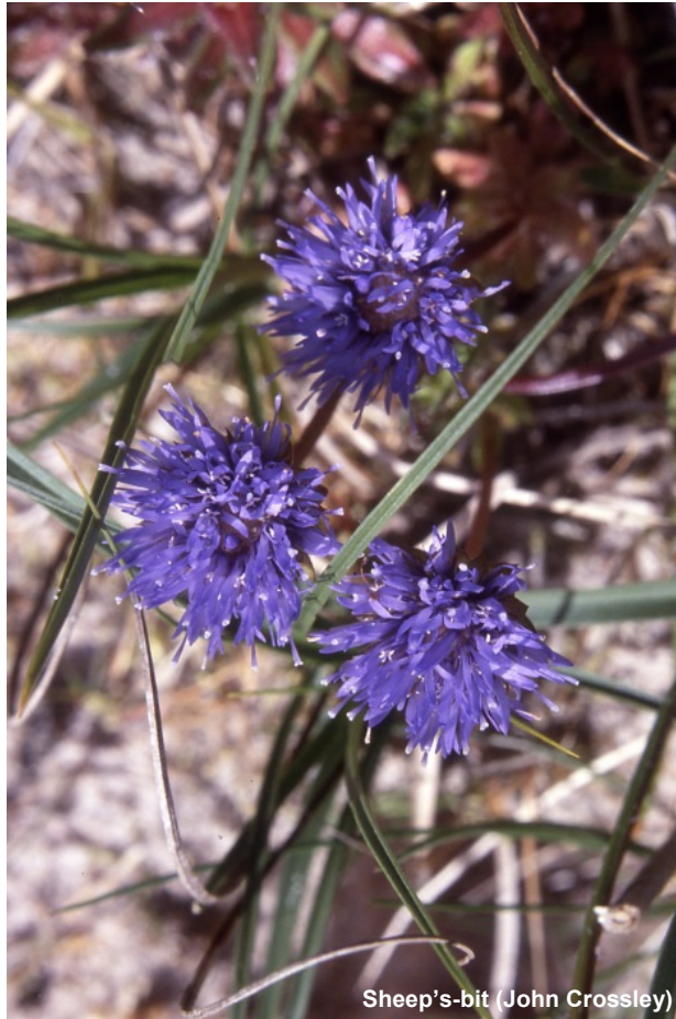
Sheep's-bit (John Crossley)

Opium Poppy Papaver somniferum subsp. somniferum (Locally Scarce), Sutherland Links, Burray, ND475957, 29/07/2013 (JEC). New for island and 10 km square.