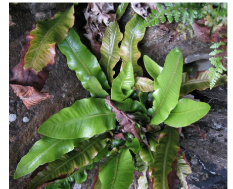
Hart's-tongue and Black Spleenwort (John Crossley)

Sea Aster Aster tripolium (Locally Scarce), St Andrews saltmarsh, Toab, HY51870462, 05/09/2013 (JEC). New for 10 km square.