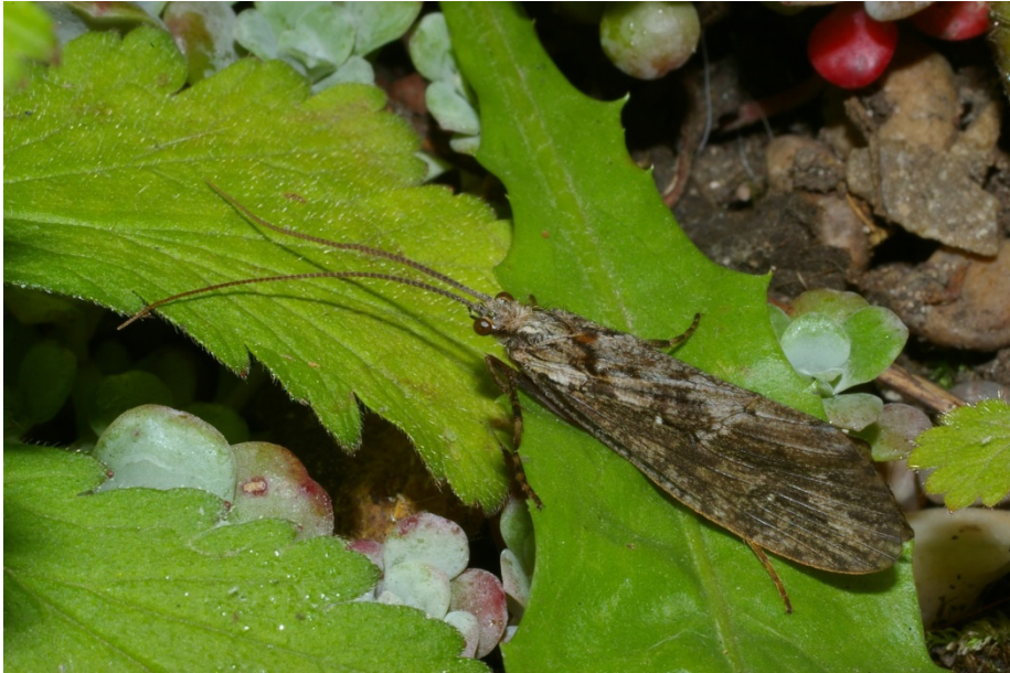
Male Great Reed Sedge Phryganea grandis (Stuart Crofts, photo not taken in Orkney)