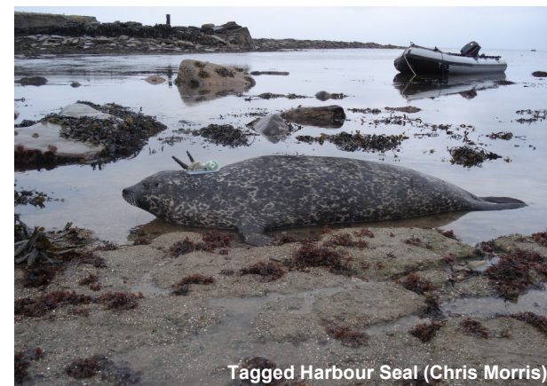
Tagged Harbour Seal (Chris Morris)

As a PhD student it is interesting for me to see where the seals are foraging, because this information will be linked with what food they are eating. Harbour seals get the water they need and the food they require from the fish that they eat. One way to find out what the seals are eating is to study the scat. After washing away all the organic material bones and other hard parts from the seals prey are left behind. These hard parts can be