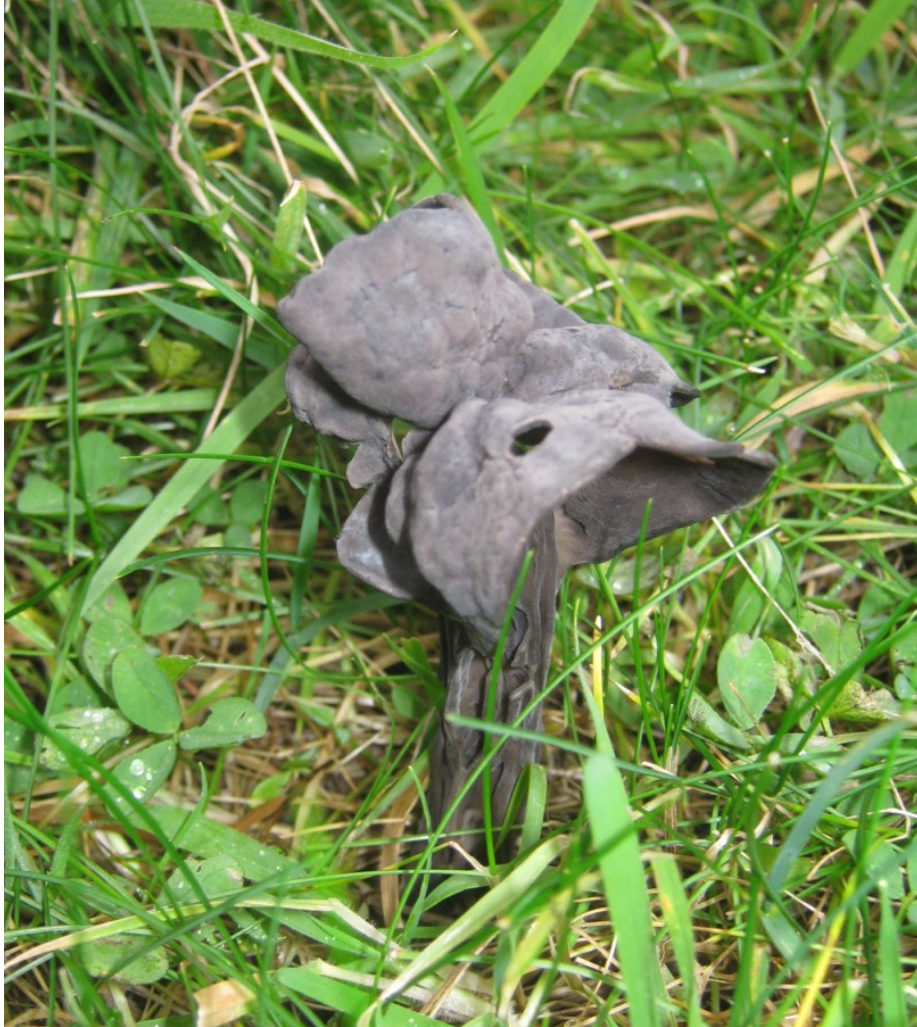
Elfin Saddle, Flotta, Nov 2014

A visit to Flotta in autumn 2010 brought a new species to the Orkney Fungi list – the Elfin Saddle Helvella lacunosa . I was walking into the plantation near the remains of the Naval Cinema, not far from the main pier, when I spotted the distinctive greyish-black and intricately sculpted fruit-bodies of this very strange fungus. It was in the grass, near hazel shrubs on the edge of the woodland.