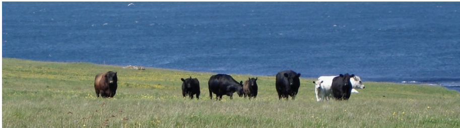
Swona Cattle (John Crossley)

On 10 th July the feral herd on Swona consisted of 20 animals: 13 cows/heifers, five calves and two bulls. This is four more than in 2012 but two cows were found freshly dead on 1 st October, bringing the total down to 18.