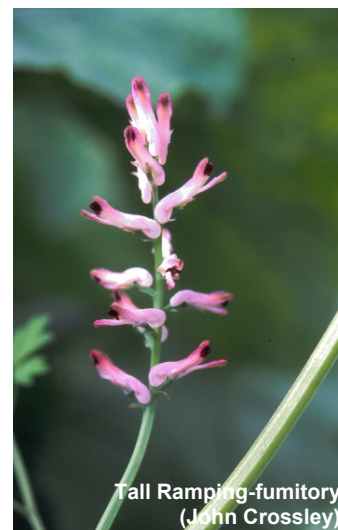
Tall Ramping-fumitory (John Crossley)

A week later around Rapness, Westray three of us set out to record everything we could find in the tetrad HY54A. This includes some fine cliff vegetation on the east side of the island, links and sandy shore on the west side at the Bay of Tafts, and much farmland, field edge and roadside habitat between. It took about four hours and we were rewarded with a list of 145 species including many of interest. Few had been recorded in even the 10 km square before, so I will my confine this report to the more unusual. These included Silver Hair-grass Aira caryophyllea ; Scaly Male-fern Dryopteris cambrensis , new for island and 10 km square; Whorl-grass Catabrosa aquatica (Locally Scarce); Small Sweet-grass Glyceria declinata (Locally Scarce), new for island and 10 km square; Bulbous Buttercup Ranunculus bulbosus