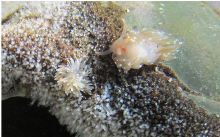
Cuthona nana (right) and smaller Facelina bostoniensis (left) feeding on hydroids growing on a shell inhabited by hermit crab

The second new species found this year is Cuthona nana – a nudibranch. This slug has certainly found its own niche. It feeds on a species of hydroid, Hydractinia echinata , which lives on the shell of a particular species of hermit crab, Pagurus bernhardus . The hydroid looks like a fuzzy covering on the shell, giving the common name, hermit crab fur. This description might give an idea of the size of many slugs – both species recorded were around 0.5-1cm in length.