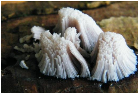
A member of the genus Stemonitis , changing colour as it matures (Lee Johnson)