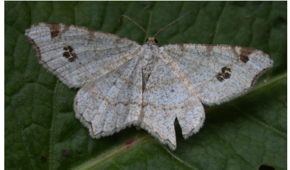
Figure 1: Peacock Moth (Sydney Gauld)

which in dry weather can be seen on the leaves below the gall. I have read that it doesn't always occur on the stem or leaf vein, but sometimes infects leaf-edge tissue and other parts, still forming the cluster-cups, though not always the banana shape. The spores appear to be expressed explosively, the results of which can be seen in Figure 5. They then may be transported on breezes and raindrops and even on invertebrates.