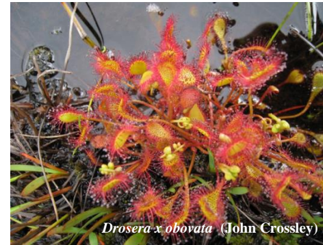
Drosera x obovata