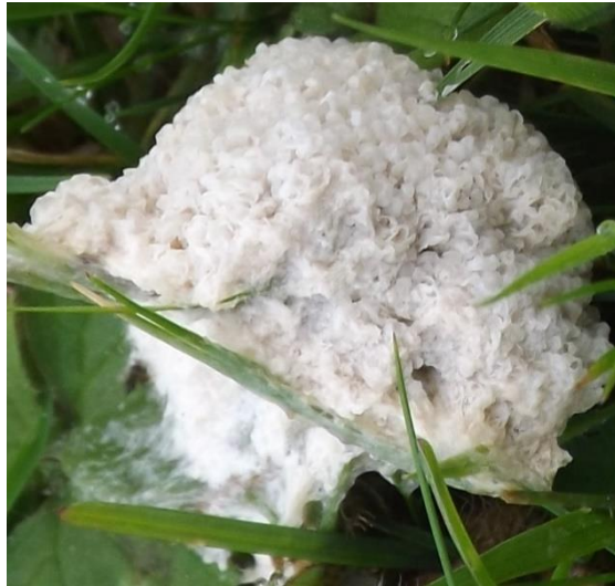
Mucilago crustacea recorded from South Ronaldsay

I am sure many of you have seen blobs of what looks like dog vomit in the grass? Well, that is likely to be the slime mould Mucilago crustacea . Not all species are as unattractive as this; in fact many are very beautiful and intricate.