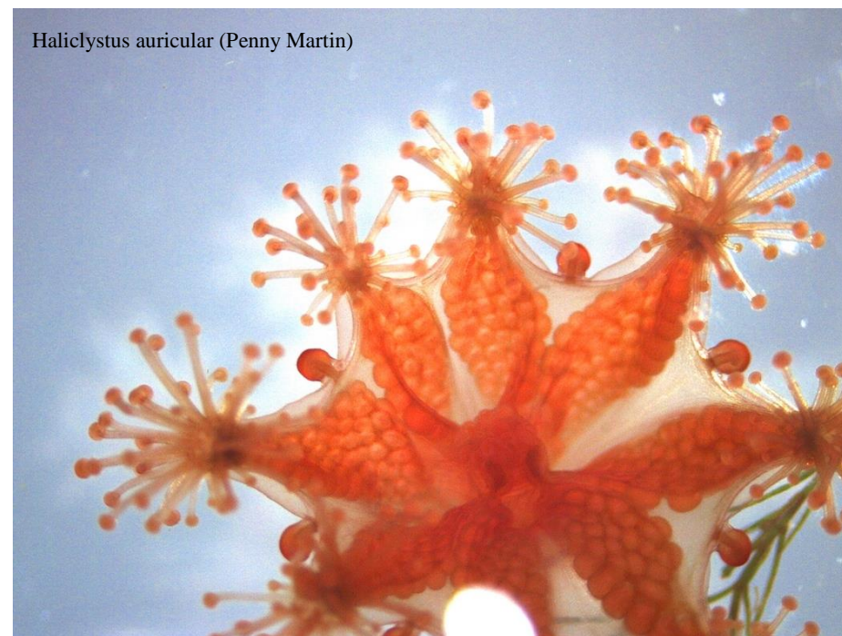
Haliclystus auricula