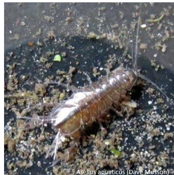
Asellus aquaticus (Dave Musson)

The total number of woodlouse species in Orkney has now risen to 10. British isopod specialists tell me that a tiny white species - Haplophthalmus danicus - is certain to be here somewhere. That would bring the total to 11. There are of course many marine isopods but that is a subject for another recorder.