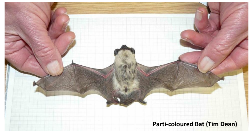
Parti-coloured Bat (Tim Dean)

Full biometrics of the bat have been taken and this individual is considered to be a young male possibly born in 2014.