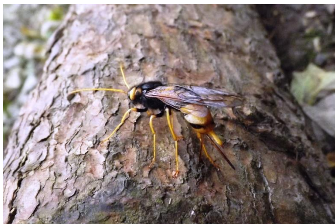
Figure 2: Giant horntail or wood wasp, Urocerus gigas , in Binscarth.

Many stumps are swathed with stout Honey Fungus Armillaria mellea , with other common wood rotters including the Deer Shield Pluteus cervinus and Sulphur Tuft Hypholoma fasciculare . In parts of the wood you can find dead wood which has been turned green by the brightly-coloured microscopic mycelium of the Green Elfcup Chlorociboria aeruginascens .