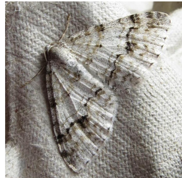
Figure 2: Welsh Wave (Mary Harris)