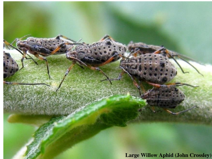
Large Willow Aphid (John Crossley)

Over several days in mid-August I noticed a flurry of insect activity around willow bushes along my farm track at North Flaws, South Ronaldsay. Bumblebees, wasps (which I seldom see at all) and flies were busy about the leaves and stems of the bushes and on the ground below, and they appeared to be feeding on something. Eventually on 22 August I noticed groups of unusually large and odd-looking aphids on some of the willow stems, and realised that the other insects must have been feeding on honeydew produced by the aphids.