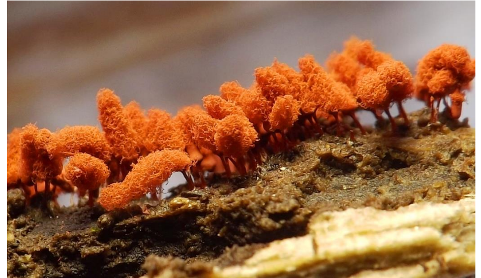
A member of the genus Arcyria , sporing on a rotten log (Lee Johnson)

They exist as invisible plasmodium for most of the time, feeding on yeast, fungal spores, algae and bacteria in soil, on litter, wood and even living plants. When the food source is used up, the slime mould migrates upwards and develops fruit bodies which are often elaborate and brightly coloured. This is the point when they are visible to the naked eye but they are very small (often less than 2mm tall) and it requires some patience to find them. Once the fruit bodies have started to spore, the structures which help to identify them become visible under the microscope, so this is the best stage to collect them for study; too early and they will collapse before these features have fully developed.