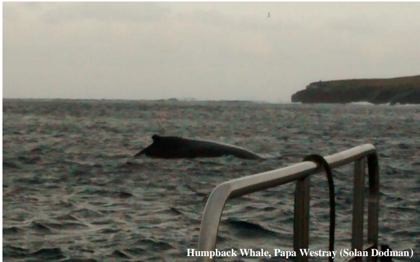
Humpback Whale, Papa Westray (Solan Dodman)