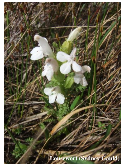
Lousewort (Sydney Gault)