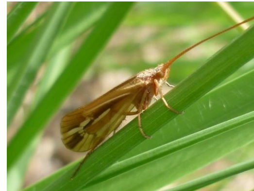
Photo: Limnephilus elegans , recently recorded for Orkney, an uncommon species due to the larval habitat requirements. This photograph is of a specimen from the Netherlands, courtesy of Ger Klaus.

Green Dock Beetle Gastrophysa viridula was recorded again on Swona, also in Hoy, West Mainland and Rousay. As usual at most sites, the beetles were on broad-leaved dock Rumex obtusifolius but also on Rhubarb at two sites.