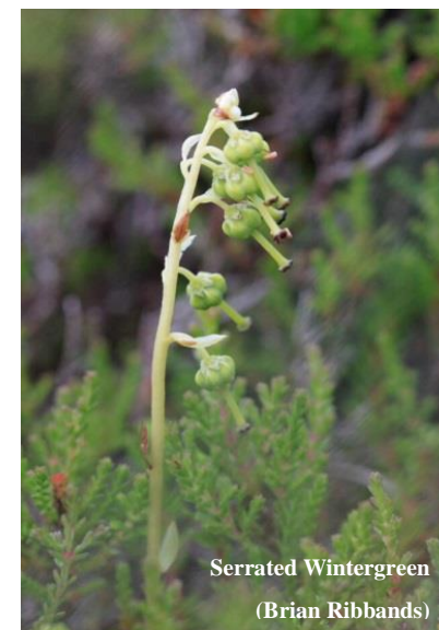
Serrated Wintergreen (Brian Ribbands)