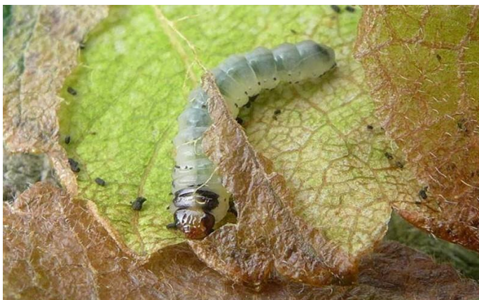
Figure 1: The tiny leaf mining sawfly Scolioneura betuleti.

Stockan, J.A. (in press). Orkney sawflies (Hymenoptera): a rich island fauna? Entomologists Gazette .