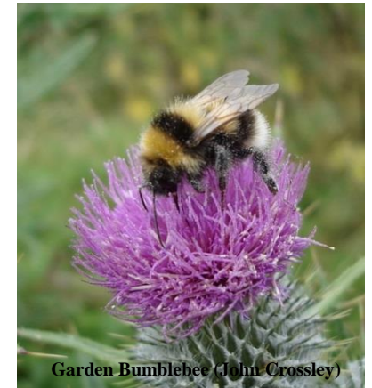
Garden Bumblebee (John Crossley)

In the photo, note colour pattern compared to that of White-tailed Bumblebee B. lucorum agg. on page 67: the central area spanning thorax and abdomen is yellow, not black as in the latter species.