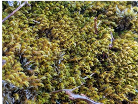
Viking Prongwort Herbertus noreus

The visit provided that special experience of learning in the company of other enthusiasts. The visitors included people of a wide range of ages and abilities, including two or three renowned experts generous with their knowledge and some near beginners.