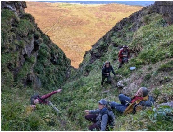
Ascending the Glen of Greor, Ward Hill, Hoy