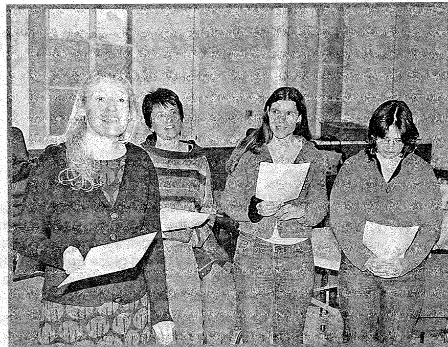
AT THE SONG SHARE: Learning The Orkney Boatman Song.

The next Song Share event will be held at the Comarty Hall in St Margaret's Hope on Saturday, December 6 between 2pm and 4.30pm.