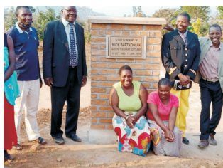
Joyous faces (above) to mark the community handover of Nthale borehole.