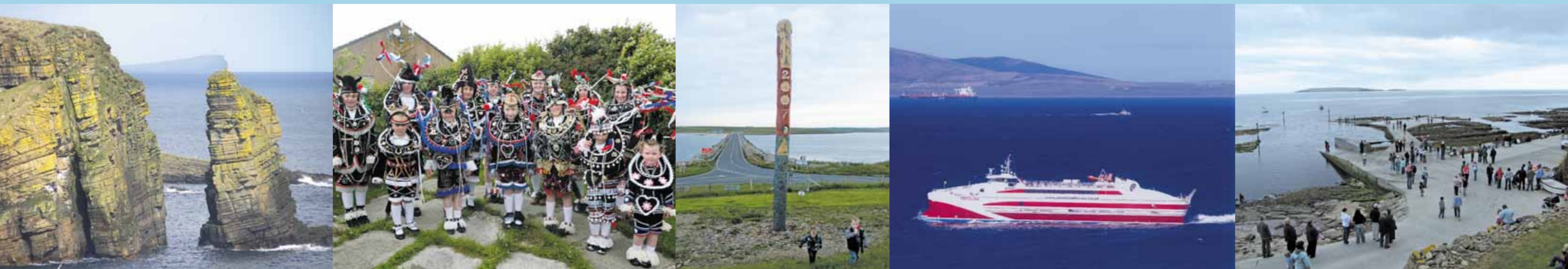
Deerness Slipway at the Geo.