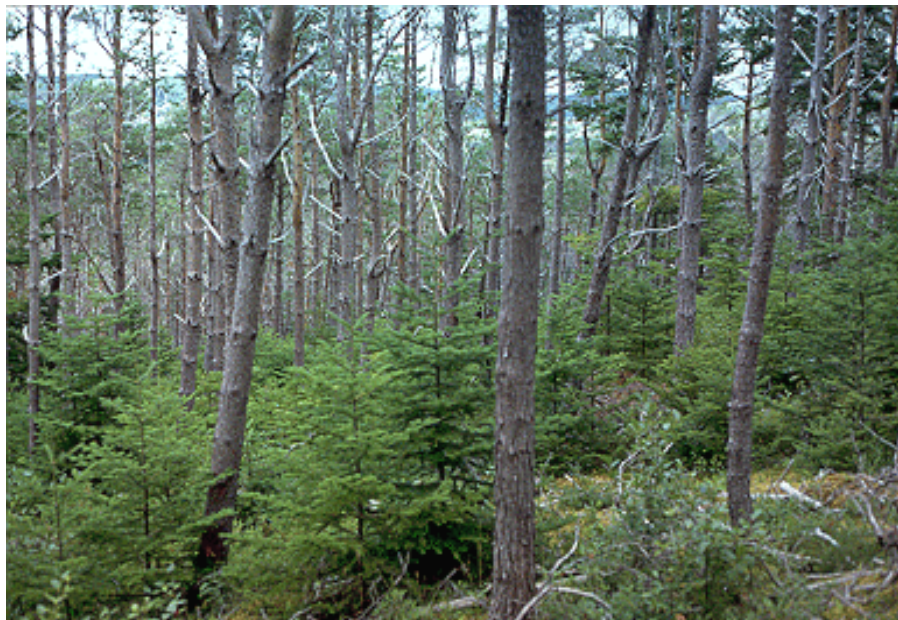
Part of the pine plantation on English Cove Road located near the top of the ridge. The small trees and poor form reflect a harsher climate than lower down on the hillside. Nevertheless, pine serves as a nurse crop for a naturally regenerated balsam fir and white spruce understorey. By contrast, outside the plantation there has been little natural regeneration of fir and spruce even before the plantation was established.

One advantage the pine plantation has over a natural spruce/fir forest, is that prior to harvesting, or blow down, or after thinning, it can serve as an interim nurse crop by providing a suitable microclimate that will enable native species and perhaps more valuable exotic species to thrive in the understorey.