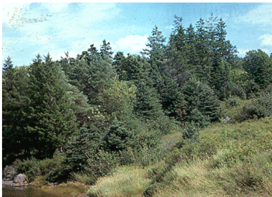
The native species of spruce, fir and indigenous shrubs and herbs take advantage of shelter provided by older naturally regenerating pine.