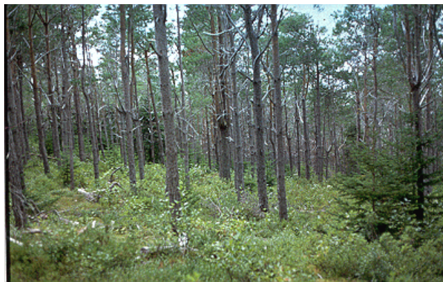
A pine plantation that was planted in 1948, in a barren windswept valley on English Cove Road, Marysville. The plantation was thinned and brashed in 1995.

There is much doubt about the suitability of pine in this climate. At face value, the deformities and sporadic dieback from soil diseases, which is more obvious in a pine plantation, than say a natural spruce and balsam fir forest, tend to reinforce the notion that pine is ill-suited to our climate.