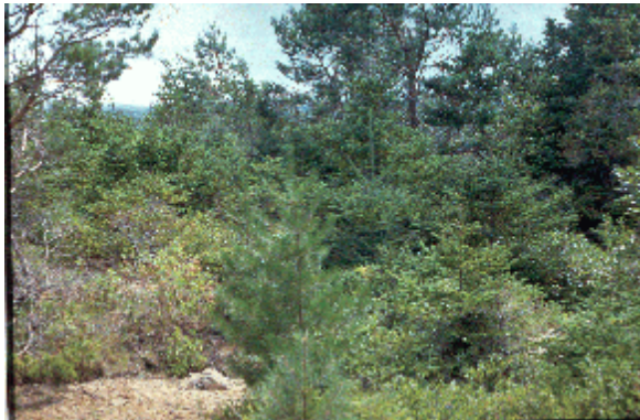
A well-developed mosaic of many age-classes (1-25 years-old) of natural regeneration exotic pine and native species.