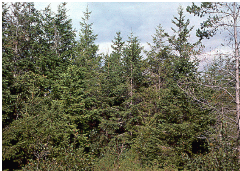
Natural regeneration of Norway spruce

A more serious problem endangering the Norway spruce stands in particular is urban encroachment. On one hand, mining interests have first call on the tract of land that includes the plantation. On the other hand, building lots are being sold along the roadside on the fringe of the plantation - resulting in removal of some of the Norway spruce. These activities serve as a reminder of the conflicts that arise from a general view of municipalities which promote rapid urban expansions and the fragility of trying to maintain a long-term forestry plantation programs close to or within municipal boundaries.