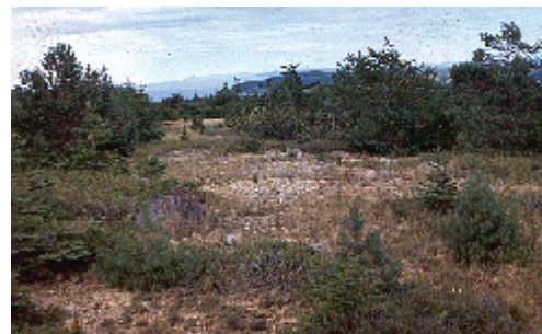
The extent of frost-heaved, barren rocks (centre) has gradually been colonized by pioneering natural regeneration by pine and later in-fill of spruce/ fir and native flora.