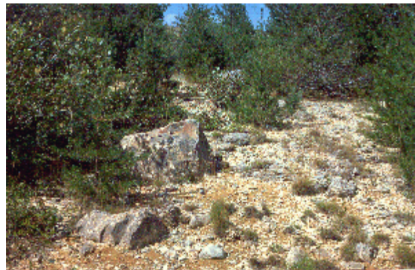
Natural regeneration of frost heaved site on an exposed ridge by pine and native species