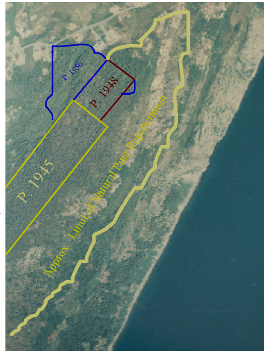
1995 aerial photo showing the spread of naturally-regenerating pine (yellow line)

The most remarkable aspect of the Marysvale plantation is the extent to which the area of pine has at least been doubled in size by natural regeneration. Actually, it is a mixture of pines and native spruce and fir. A 1948 aerial photo shows that much of the top of the ridge had very little vegetation. Frost heaving is the main obstacle to colonization by native vegetation. However, mainly over the last 10-15 years, pine has not only colonized and is thriving on this harsh site but also, by trapping organic debris, has provided niches for additional colonization by mats of native flora, including trees and shrubs. The fact that some pine become diseased and die is a moot point, because they have fulfilled a valuable role by initiating the forest restoration process of a harsh site which native flora could not.