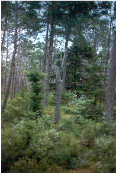
55 year-old thinned and culled stand of Scots pine acting as a nurse crop for naturally regenerated balsam fir and white spruce (note the moose browsing).

However, deformity in pine is most often a genetic trait. For example, Jack pine growing in the best of its natural range still doesn't have a particularly good form or great quality compared to say white pine. The same can be said of some provenances of Scots pine. Scots pine from Swedish and German provenances are typically straight trees much sought after for high quality lumber. By contrast, the rugged form of Caledonian pine (a distinct race of Scots pine) from the Highlands of Scotland is valued much more for its aesthetic qualities than its lumber. A prime example of the aesthetic attributes of Caledonian pine in an urban setting can be seen on Pine Bud Avenue in St. John's and in the Sir Robert Bond Historical Park in Whitbourne.