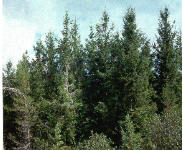
Norway spruce planted in 1950 plus naturally regenerated Norway spruce in the foreground.

Much more significant, is the extent of natural regeneration of Norway spruce which is a good sign of its adaptability to the local environment. Unfortunately, too many red squirrels, combined with a poor seed year (1999), are responsible for the conspicuous absence of any new cones on the Norway spruce. Of course, one should encourage a greater degree of biodiversity of flora and fauna within the pine plantations - including attracting Pine Marten as a natural control for red squirrels.