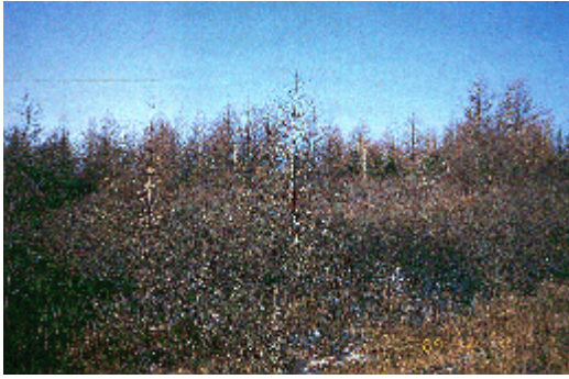
2-storied high forest system , starting off with naturally regenerated alder thickets mixed with spruce-fir which will eventually replace the current high storey of 15 year-old Japanese larch.