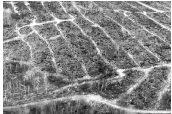
Natural regeneration on this pattern of timber extraction trails for the 'donkey' or timber jack in later years has evolved into alternating strips of birch on the trail and balsam fir between the trails like strips that can be seen in the adjacent aerial photo. The potential silvicultural system is one that is an even-aged strip shelterwood of birch coppice and balsam fir 'standards' on a 40 year rotation.