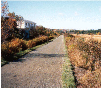
This is what most of the vegetation along the trail looked like about 5 years after the railway ceased operation

Below is the succession of a naturally regenerated woodland strips along part of the Trans-Canada Trailway on the old railway bed. This section is known as the Arboretum Walk which passes through Mount Pearl and east of the lower Waterford Valley. They demonstrate the kind of shelterwood strips foresters should encourage as the bulwark for reforesting man-made barrens.