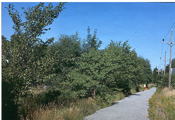
Naturally regenerated European elm, European ash, sugar maple, hybrid birch, Norway maple mixed with native white spruce, birch, and pin cherry 25 years after railway closure (this is near the beginning of the Trans-Canada Trailway)