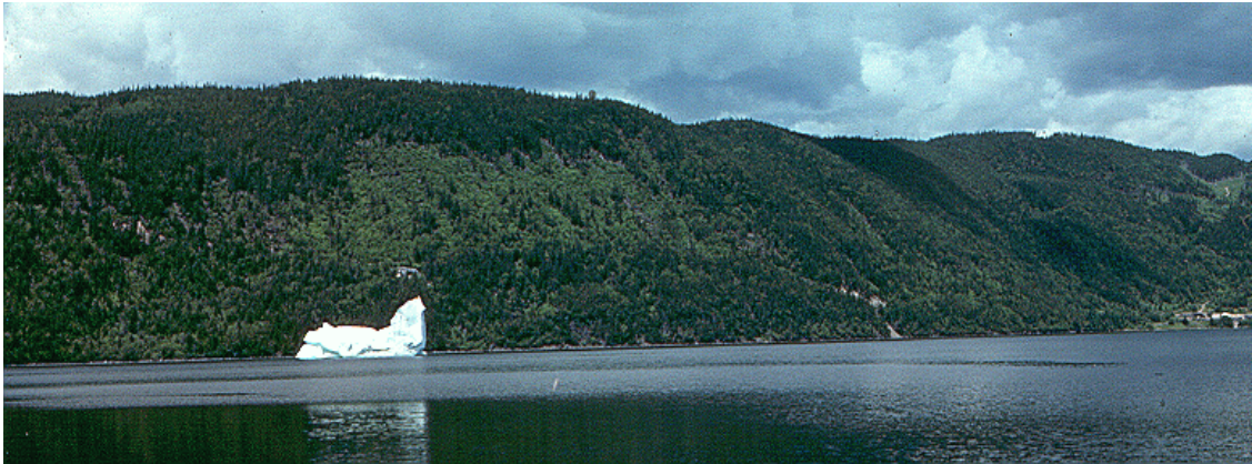
On the cool, moist and fertile slopes along the coastline, birch along with balsam fir is an early colonizer of disturbed sites.