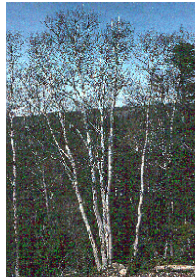
Birch over-storey on the decline as spruce and fir begin to dominate. This could be developed into a coppice-with-standards system .