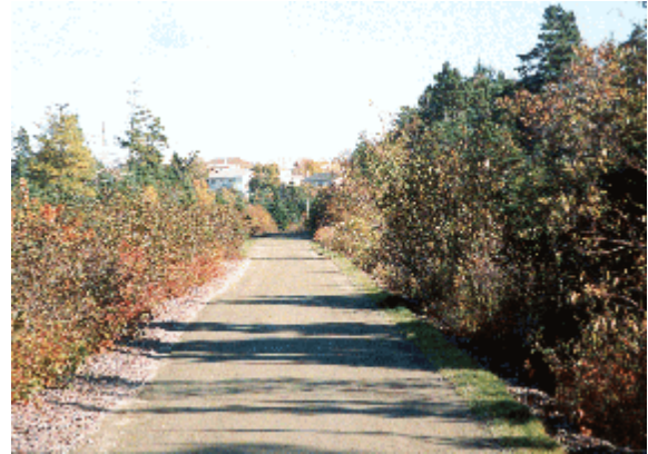
10-15 years later after railway closure