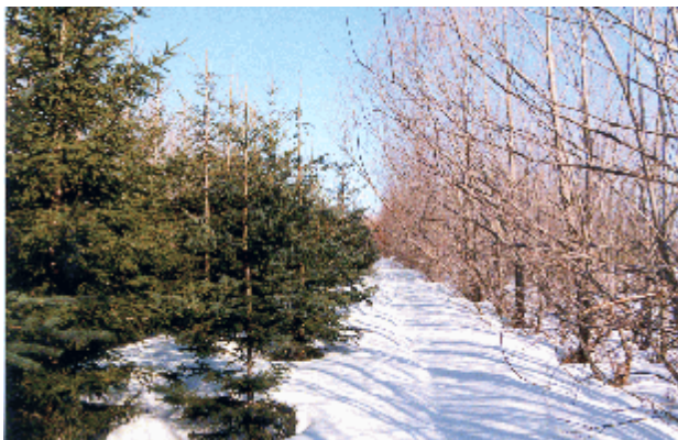
12 year-old Norway spruce being shaded by the willow clones with a broader branching habit.