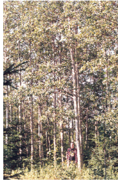
This demonstration 25 year-old aspen coppice-with-standards system at Pasadena was ideal for establishing the understorey of exotic conifers.