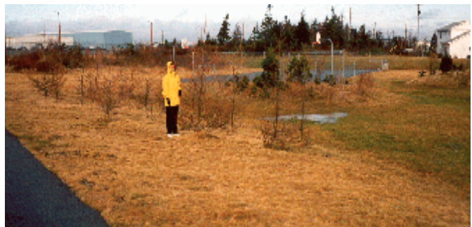
Top right is a stand of naturally regenerated scrub forest of balsam fir, black spruce, tamarack interplanted with exotics; top left is mostly birch, alder and dogberry and a few spruce and balsam fir saplings also interplanted with exotics; front-left is 4 year-old Japanese larch. On the berms (middle-right) and behind that a mixed species group (see below).