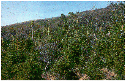
Native birch used as a shelterwood for a Norway spruce plantation on the barrens of Iceland