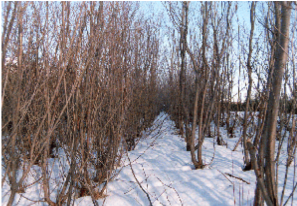
15 year-old osier (willow coppice) that ideally would have been coppiced at least twice.

Willows are used as the primary shelterwood storey. They can be either harvested on 4-5 year rotation coppice, or, if it has no commercial or residential use, it will be allowed to collapse by which time regeneration of spruce or fir will colonize the willow strips. The willow shelterwood was planted in 1985 and consists of about 50 clones. It survived a wildfire in 1986 which destroyed the conventional spruce plantation established by Abitibi-Price which owns the property and encouraged the establishment of the shelterwood trial.