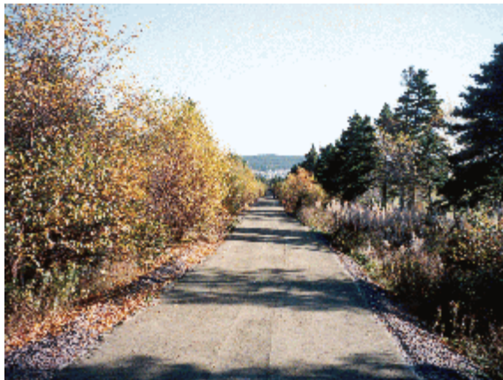
About 20 years after railway closure