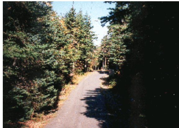
A different section 25 years after railway closure, now called the Arboretum Trail.