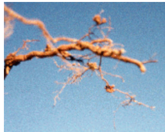
Nitrogen-fixing legumes of alder