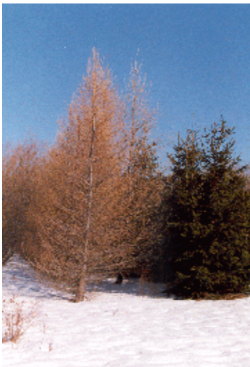
Hybrid larch of reasonably good form but with a slight bole-sweep due to occupying the windward edge