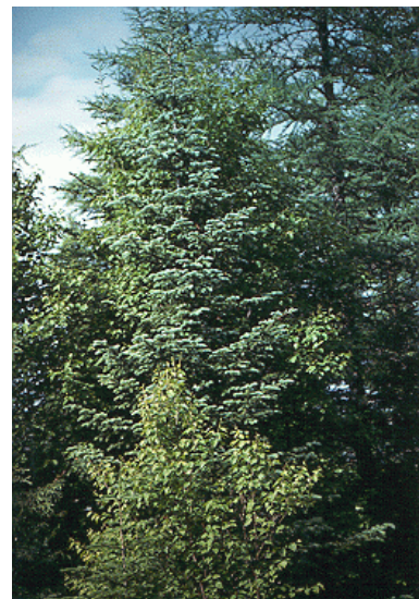
In a natural shelterwood system, the Newfoundland blue fir is at its showiest.