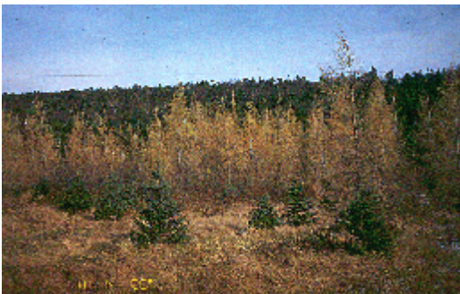
2-storey high forest system where the white spruce understorey will eventually replace the mature Japanese larch high storey.