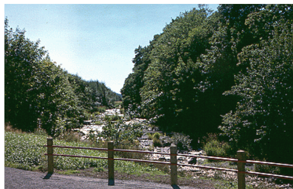
Natural regeneration of native and exotic trees 25 years after railway close (railway bank is on the left side of the river). The photo was taken from Mile 0 of the Trans-Canada Trailway.