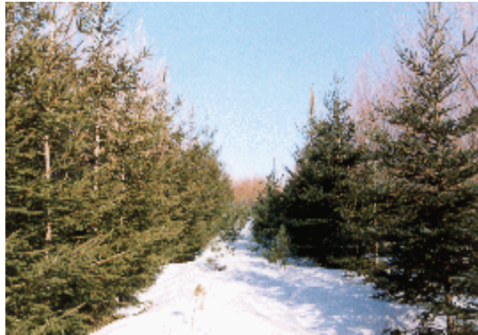
The gap was planted with Austrian and Scots pine which was obviously unsuited to these soils.