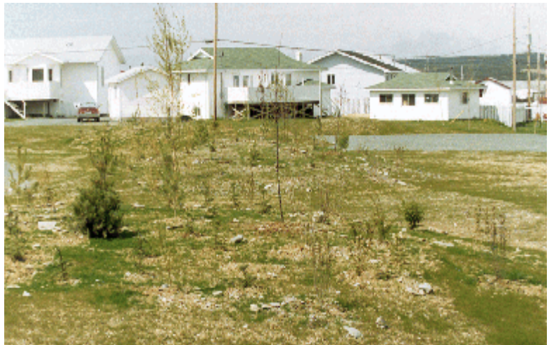
1 st growing-season results of mixed species group consisting of birch, laburnum and Norway maple standards, inter-planted with seedlings of Austrian pine, white spruce, larch, and tall flowering shrubs.

In 1996, Stirling Robertson, the author's son, established a number of shelter plantings for the City of Mount Pearl's Environmental Forest Project . The photos on this page illustrate some of Stirling's planting. Stirling's first of many planting projects over a 3-year period was the small-scale shelterwood system for a park in the vicinity of Babb Crescent, Mount Pearl shown in the adjacent photo.