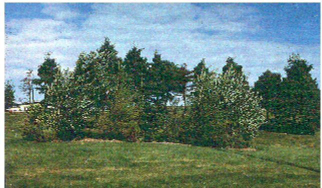
A small shelterwood consisting of only Larch, Veitch's fir and Bay willow has cured the problem of jets forming under the black spruce spinney and the associated severe snow drifting stunted spruce trees and made pedestrian miserable.