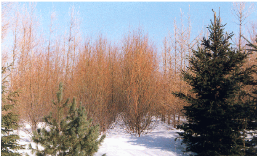
Section of the shelterwood of larch, willow, Austrian pine, and white spruce.