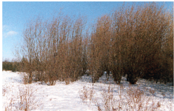
Willow clones with a compact, narrow branching habit are preferably to restrict shading of spruce/larch.