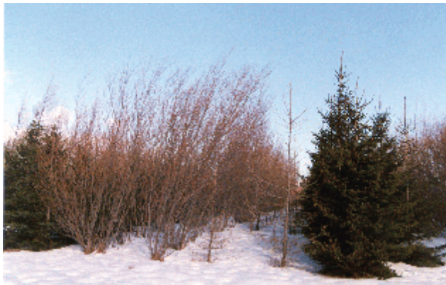
15 year-old shelterwood coppice and 12-year-old spruce.