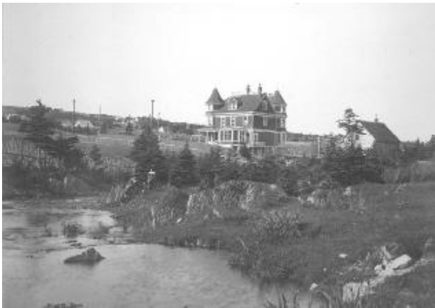
Waterford Hall circa 1910 surrounded mostly by farmland and clumps of naturally regenerated spruce and birch.