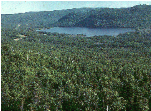
Regions like this, with an insignificant fire-history, are notable for very diverse forest landscape ecology.