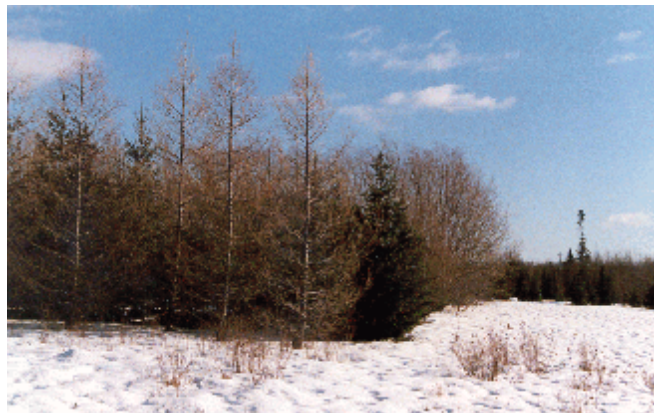
12 year-old Japanese or hybrid larch and spruce dominating the windward edge of the stand