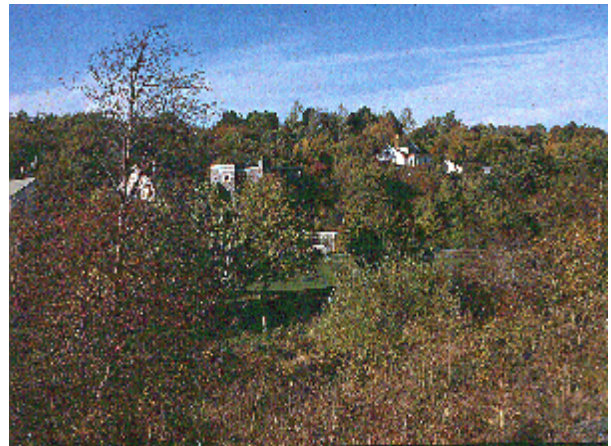
The urban forest adjacent to Waterford Hall as it was in the year 2000.