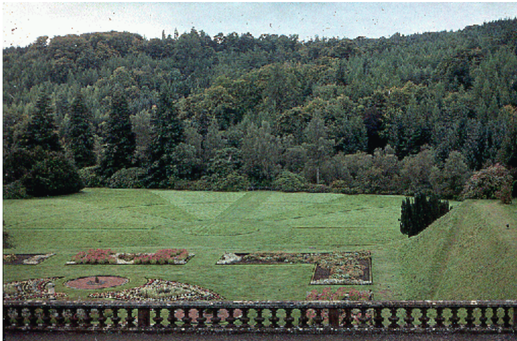
The ultimate multipurpose, mixed species, uneven-aged multi-storied high forest system at Drumlanrig Castle, south Scotland. A better definition for this plantation is Forest Garden .