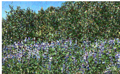
In addition to birch shelterwood, Alaska lupin (a leguminous plant) is also used by Icelanders to condition and fertilize the soil for tree plantations.