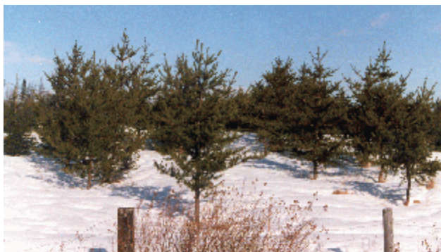
15 year-old spruce-pine conventional plantation