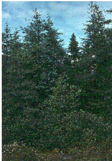
A complex mixture of spruce, fir, tamarack, birch and tall shrub is analogous to a traditional cultivated shelterwood.