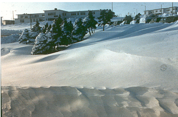
Severe snow drifting is as much a problem for the black spruce spinney as it is for pedestrians.