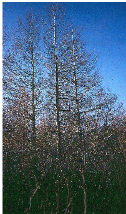
The excellent growth of these 11-13 m tall, 15 year-old Japanese larch above Bay Bulls was greatly enhanced by the shelter and nitrogen fixing attributes of alder thickets.