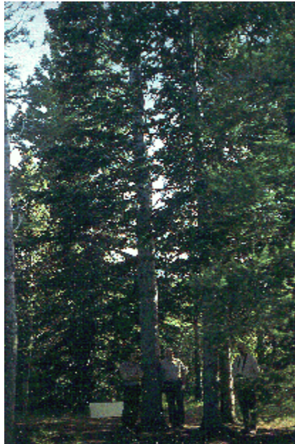
100 year-old Engelmann spruce in east Iceland