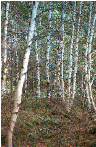
Birch shelterwood with no tree-shrub understorey