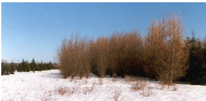
Another view of a 15 year-old conventional spruce-pine plantation (left) compared to the shelterwood system of 16 year-old willow osier (centre) and 12 year-old larch and spruce.