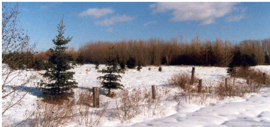
Shelterwood of willow, larch, pine and spruce (background) and an older, conventional monoculture plantation of white spruce( foreground).