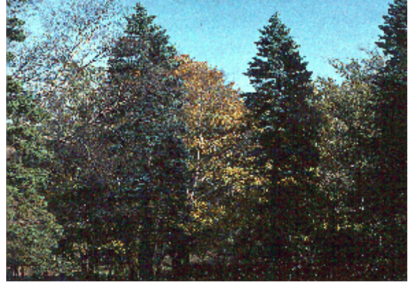
Bowring Park is essentially a microcosm of many styles of shelterwood. It is perfect outdoor laboratory comparing many styles of natural and planted shelterwoods, monospecific plantations and high forest and their sensitivity to wind .