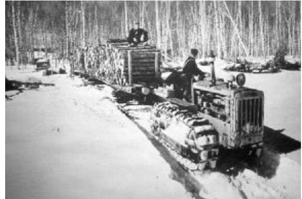
The small tractor and sleigh called a 'donkey' was used to haul out the timber from strip-logging cut by hand in the 1950's in the Hawke's Bay area.