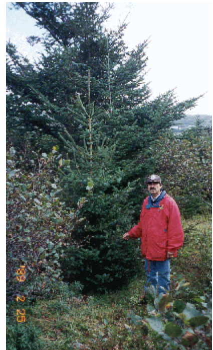
Nitrogen-fixing alder thickets and slow growing balsam fir have greatly enhanced the rapid growth of this 7 year-old naturally regenerate Sitka spruce at Trepassey