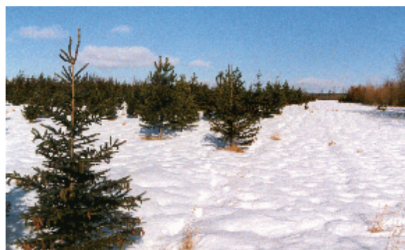
15 year-old spruce-pine conventional plantation