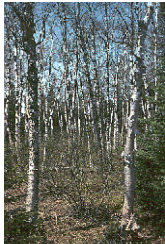
An older birch shelterwood with tall-shrub understorey and a few spruce seed trees