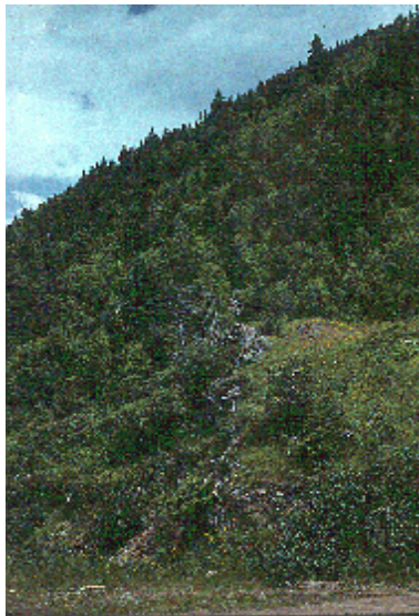
On a slope selectively cut for fir and spruce, birch finds a useful niche in improving nutrients levels by recycling.