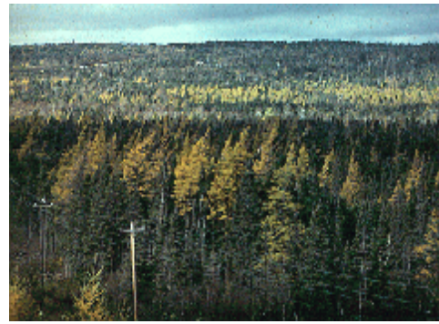
Larch fulfills much the same role that birch does and tends to occupy the moist sites following wildfires.