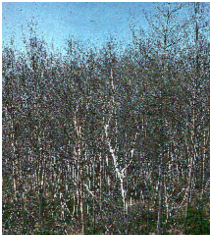
Shelterwood overstorey of birch, tamarack and pin cherry, with good understorey regeneration of spruce and fir. This can be developed into a combination of coppice-with-standards and mixed shelterwood compartment systems