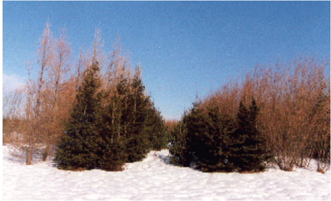
The larch and even the spruce is gradually replacing the willow as the primary shelterwood.

At this point there is the choice of maintaining willows by coppicing, or the let it die out and be gradually replaced with natural regeneration or planted with more valuable species.