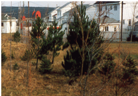
Part the same planting in the end of their 5 th growing season.