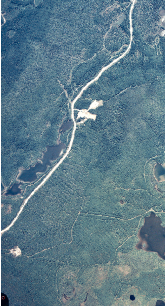
A pattern of naturally regenerated Strip shelterwood of alternating strips of birch and balsam fir, respectively, which developed from soil disturbance by timber extraction vehicles near Hawke's bay