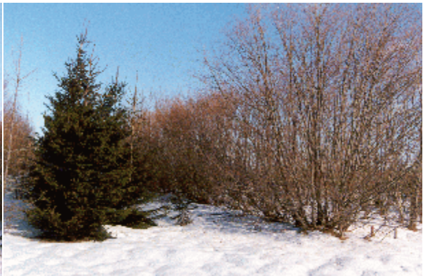
The same spruce as adjacent, but with a mixture of willow clones.