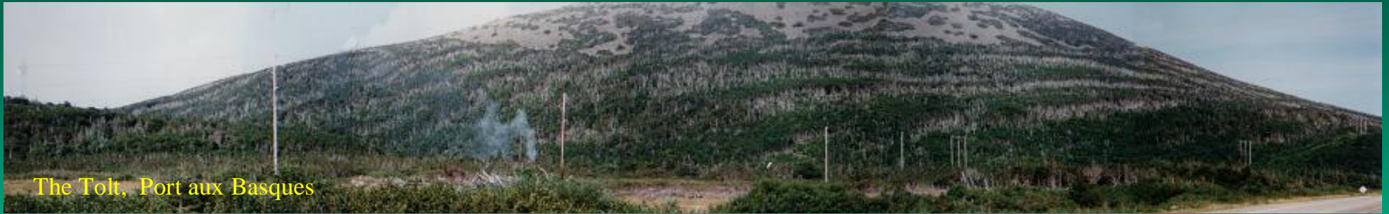
The Tolt, Port aux Basques