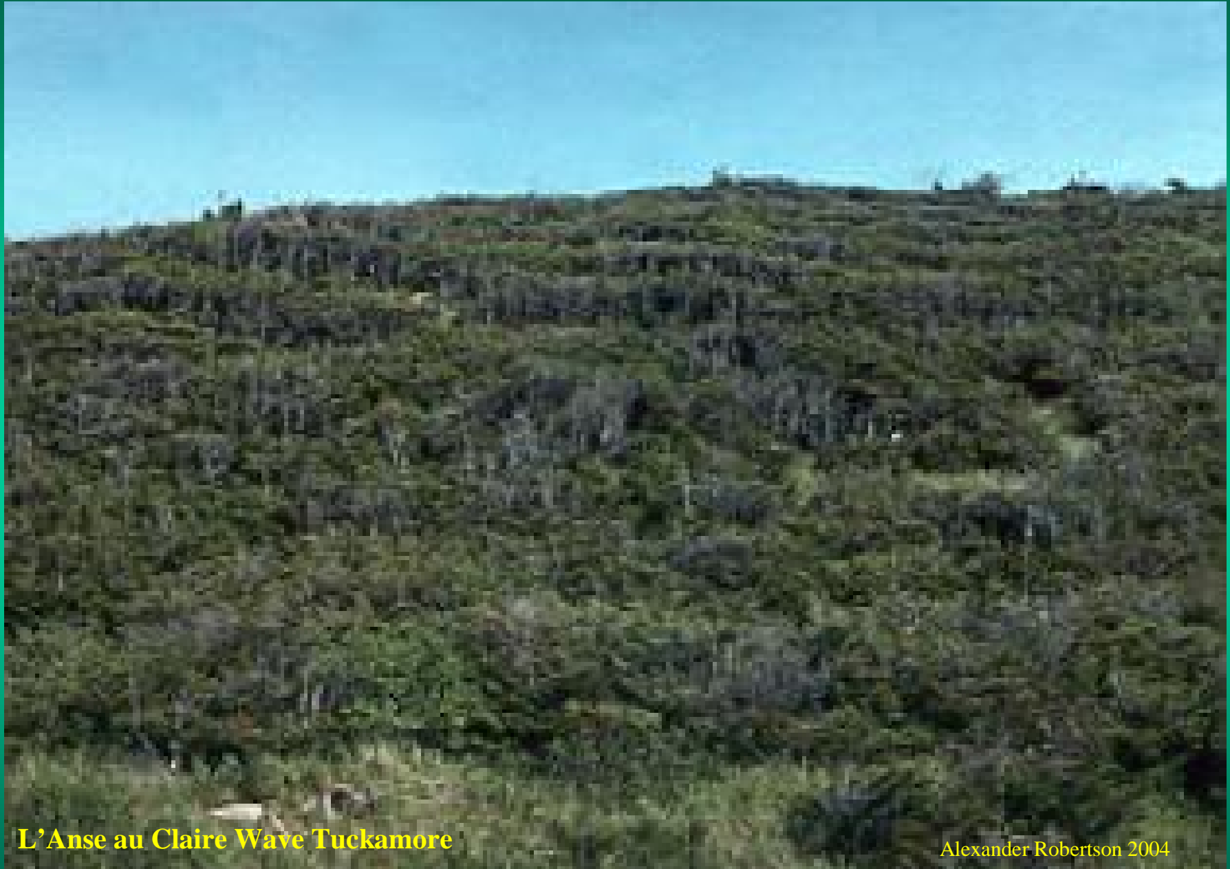
L'Anse au Claire Wave Tuckamore