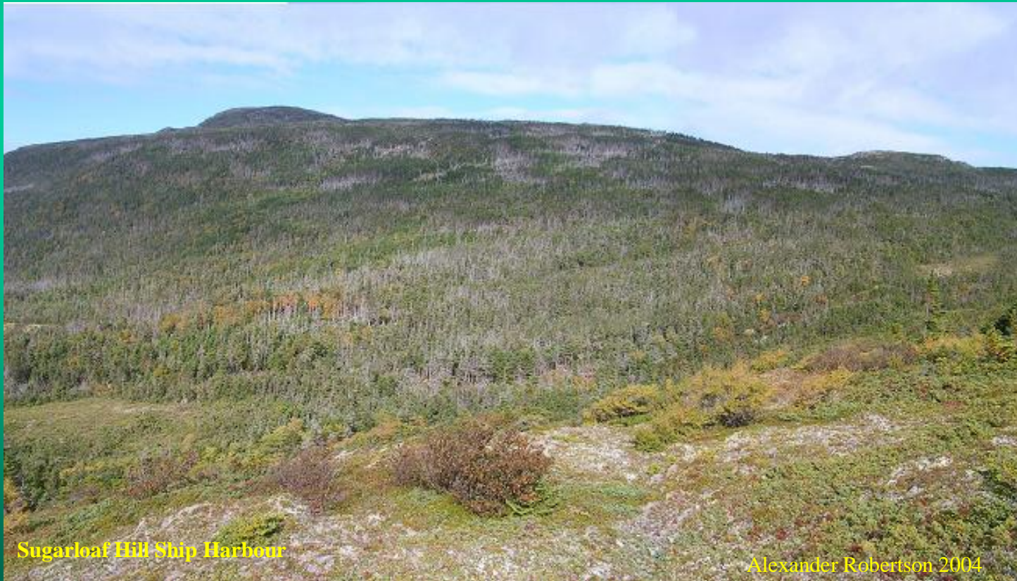
Sugarloaf Hill Ship Harbour