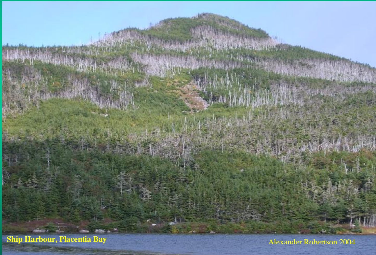
Ship Harbour, Placentia Bay