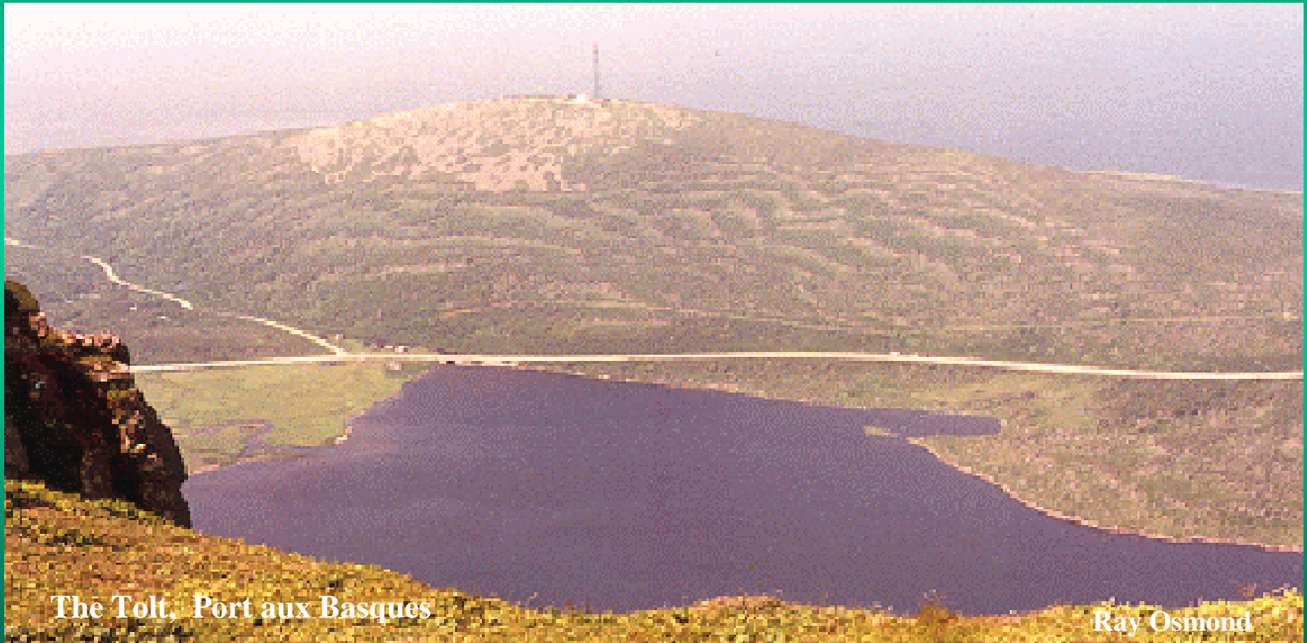
The Tolt, Port aux Basques