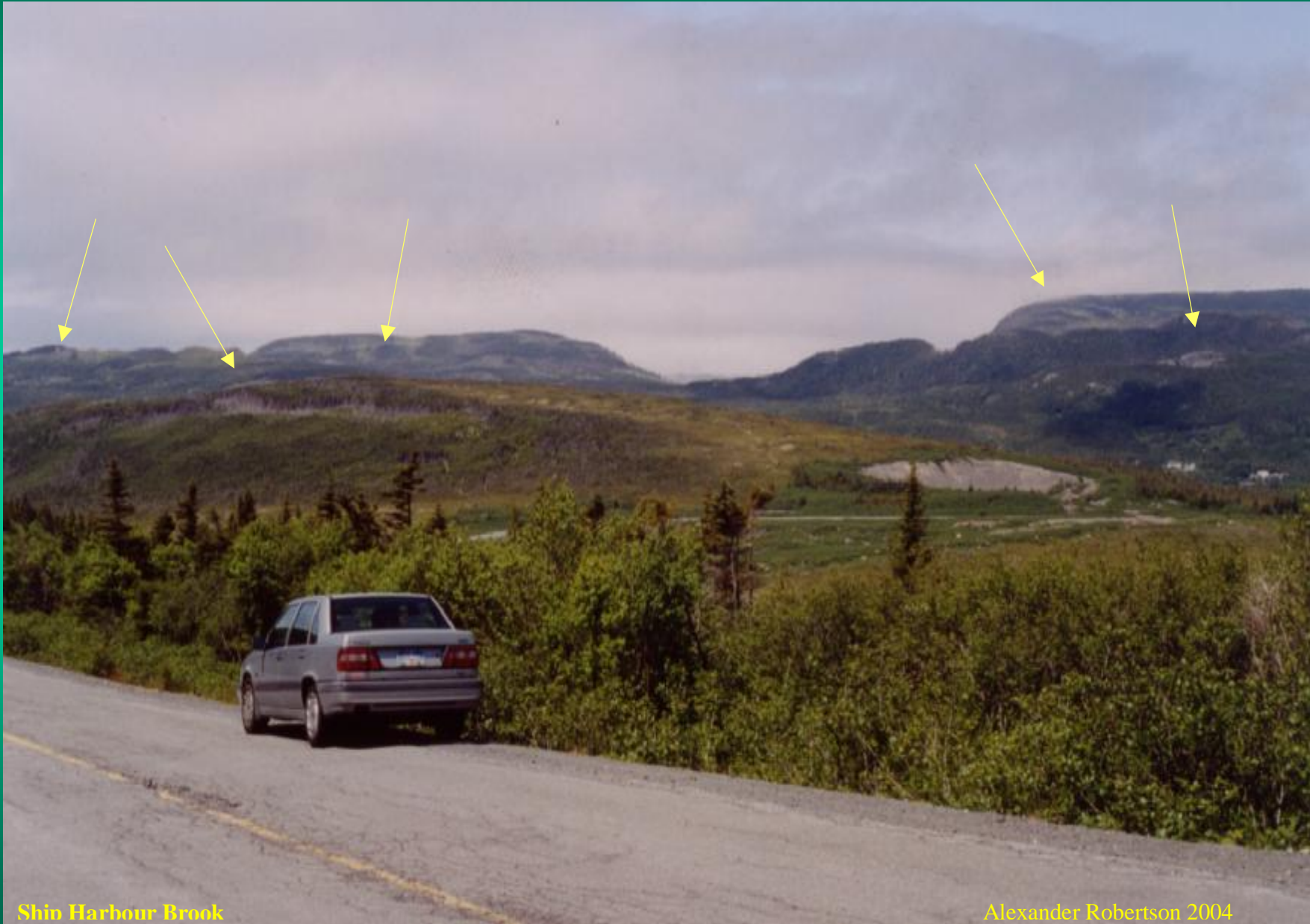
Shin Harbour Brook