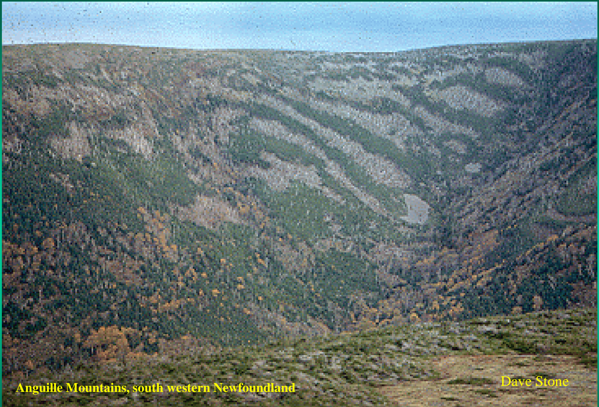
Anguille Mountains, south western Newfoundland