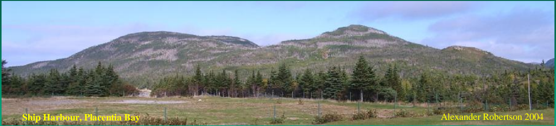
Ship Harbour, Placentia Bay