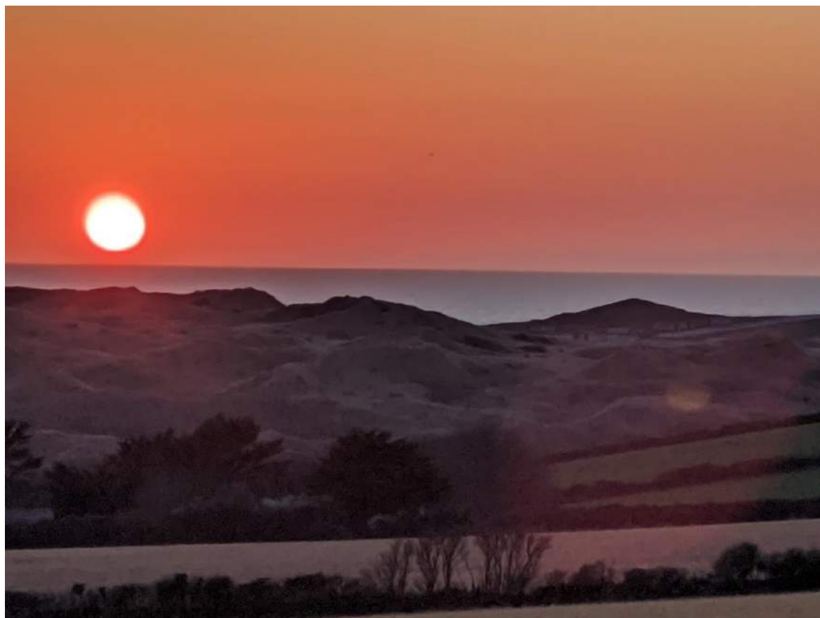
Sunset – 31 st March 2020 – From Jubilee Close