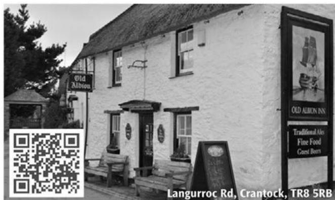
Langurroc Rd, Crantock, TR8 5RB