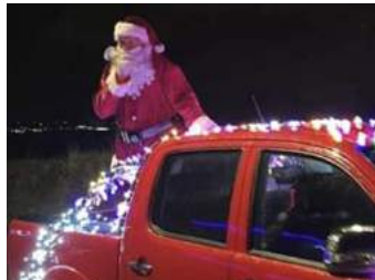
Santa arriving in style

RAFFLE TICKET PRIZES still to be collected