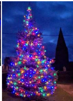
Christmas tree by the church