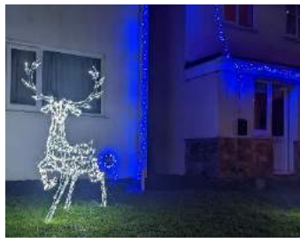
Example of the village lights around the houses