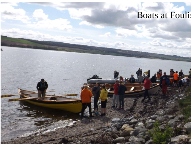
Boats at Foulis Point