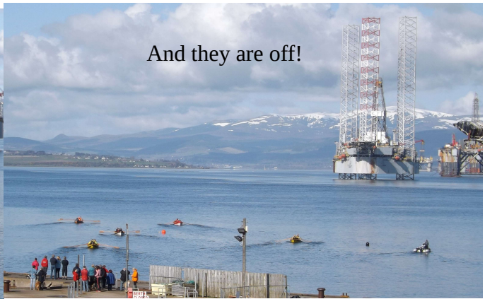
And they are off!