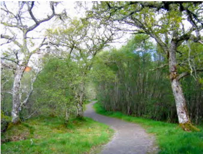
Fig 1: All abilities access path path in the north end of the wood.

The name Gearrhoille comes from Gaelic an garbh choille , the rough wood, (Watson 1976) a description which still fits the woodland. The ground layer is dominated by rough grasses, rushes and mosses, in places showing signs of having been heavily poached by animals in the past. It is divided in two by a burn Alltan na Beiste (Little burn of the beast! – possibly otter [ beist dubh ]). This burn dominates the drainage in most of the wood.