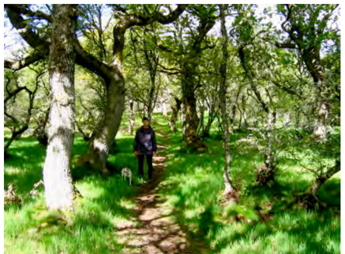
Fig 2: Rough path in dry north wood

In recent years the Gearrhoille Community Woodland Group has put two paths and a car park into the wood plus an access path from the village to the wood (see Appendix map). The main path near the burn has been installed to “All abilities access” standard (Fig.1). This continues as a rough