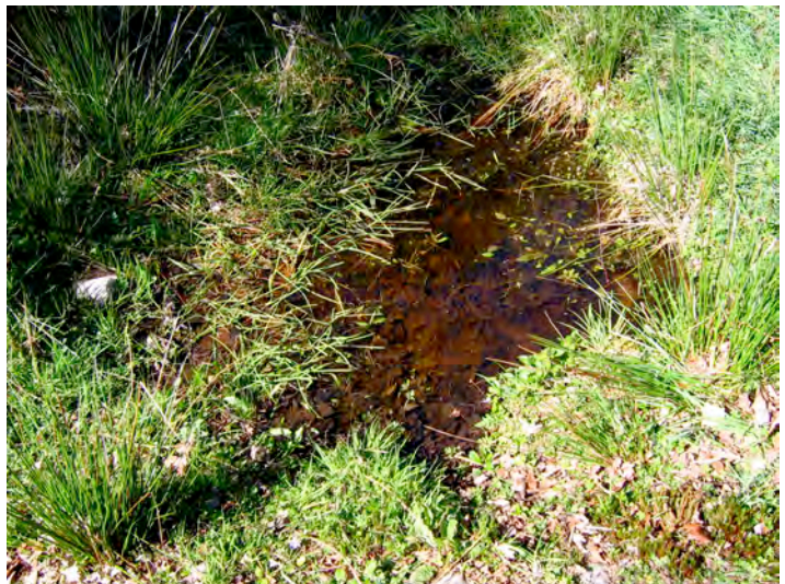
Fig 5: The tapole pool

NH 6008 8993 – very small pond and still ditch, either side of the all abilities path (Fig 5). Spawn remnants found 1 st May and frog tadpoles found on all visits. Up to 12 tadpoles visible at one time. Netting indicates a small but healthy population of frog tadpoles in both the pond and ditch.