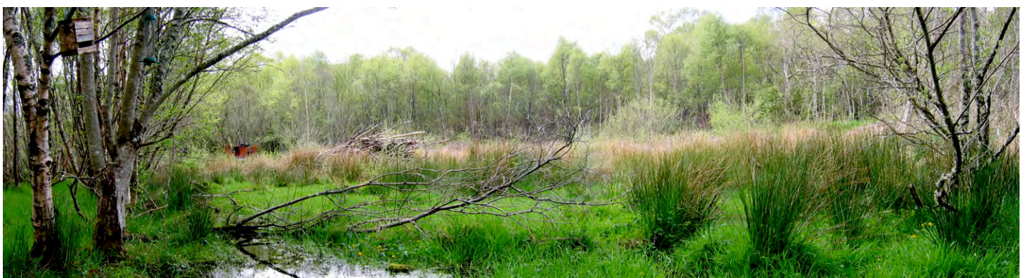
Fig 9c The “Curling Pond” from the north east corner.