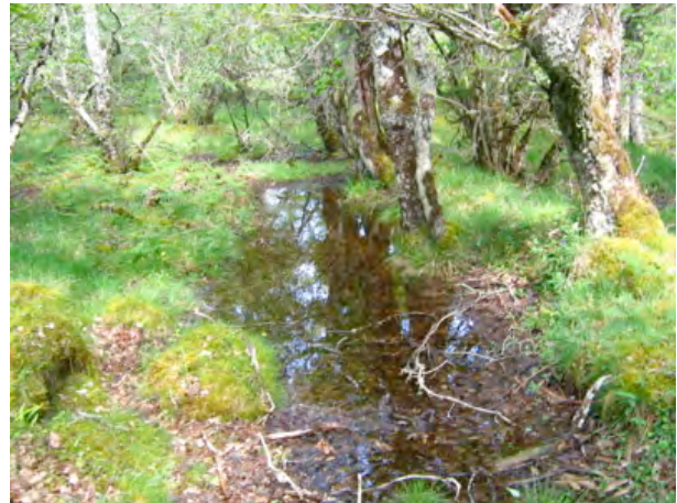
Fig 6: The marshy pond by the top dyke

Left – 20 th May after a period of drought. Right – 31 st May after very heavy rain.