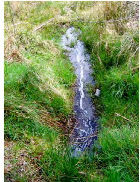
Fig 8 Foaming in curling pond inflow conduit.

The present curling pond can no longer be considered a pool as it is either overgrown or has flowing water (Figs 7,8 & 9). The centre has large piles of birch and willow brushings cleared from the edge of the pond several years ago. The water areas have become totally overgrown by semi-aquatic grass, rushes and sedges with the exception of the burn which flows along the east side of the pond.