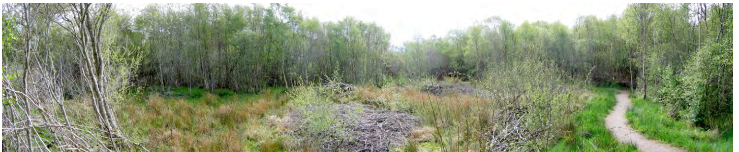
Fig 9b The “Curling Pond” from the north west corner.