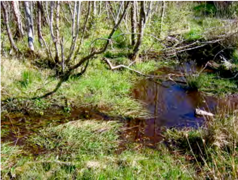
Fig 7 Curling pond burn.