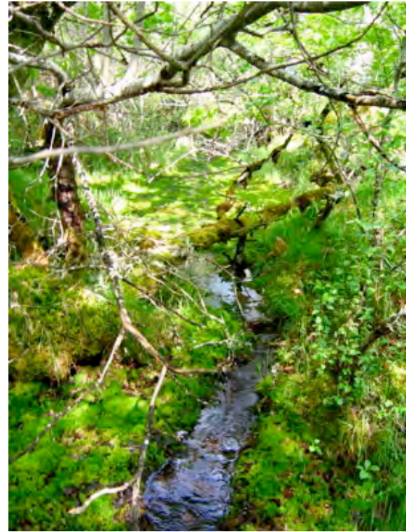
Fig 4: The “green burn”

Left – 1 st May after a period of drought. Right – 31 st May after very heavy rain.