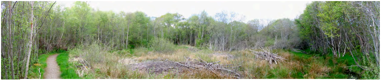
Fig 9a The “Curling Pond” as first seen approaching from the all abilities path.

Despite the deterioration of this pond, many of the best breeding sites for amphibians in the Highlands are former curling ponds (e.g. Knowles et al , 2002) and it is felt that this site could be developed to support a significant amphibian population.