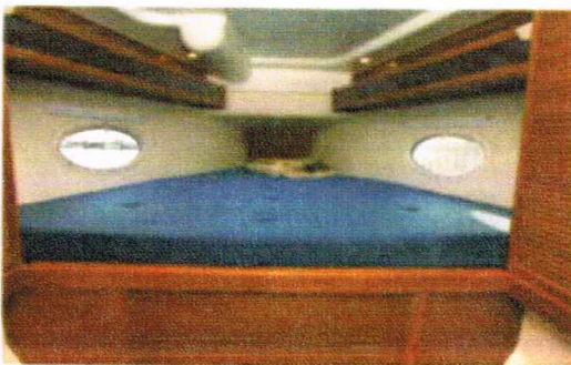
A warm atmosphere where the build quality shows through.