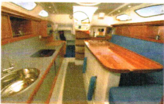
A surprising volume: 4 people for an Atlantic crossing, 6 for a weekend or 8 for an afternoon.