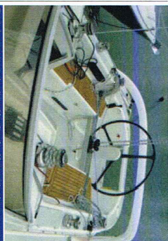
The helm position is dominated by the wheel but seating is good and visibility excellent

The floatz also provide additional stowage, the large lockers on the floatz access a large, 2 m stowage area in each floatz and there is an option to have a deck hatch in the transom of the floatz to allow a kayak to be loaded into the floatz. The brochure says that folding bikes, dinghies and other large items can be stowed in the floatz. There is certainly the space! If the boat is being used in the winter the cockpit backrest and the hard screen combine to produce an