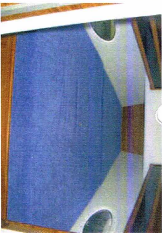
The forward V berth is a reasonable double.