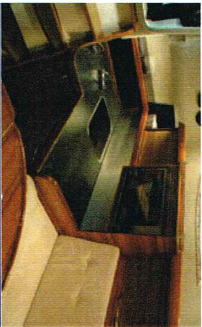
Galley area on the classic layout

A new option for 2009 is the 'Classic' interior, which offers seattees both sides of the table, with a new L-shaped galley to port of the companionway.