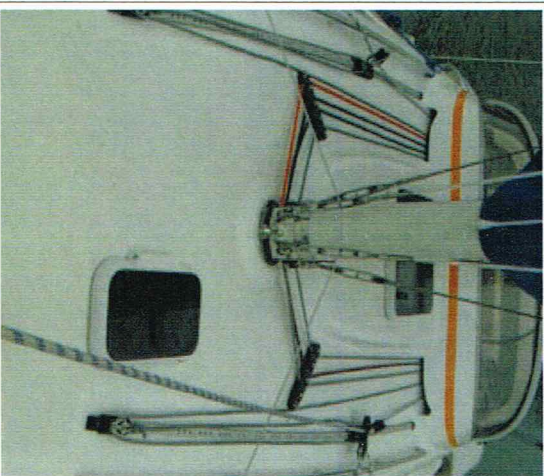
View from the foredeck looking aft, note the narrow side-deck but good handholds.