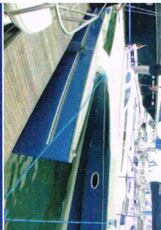
Similar 35 at Southampton Boat Show

On deck there are plenty of cleats, handholds and the boat feels secure