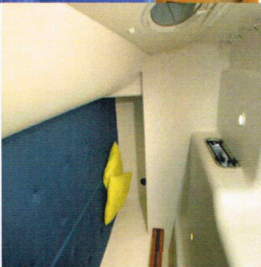
The aft berth is larger than this looks! A good sea berth and the curved moulding to the left of the picture makes a good backrest for sitting up and reading or having a cup of tea in bed!

However the designers try to minimise movement forward at sea by providing single line reefing of the mainsail and the roller furling for the genoa led beneath deck to the cockpit. Indeed just about everything, except pulling out the retracting bowsprit and setting it up on deck can be done from the cockpit.