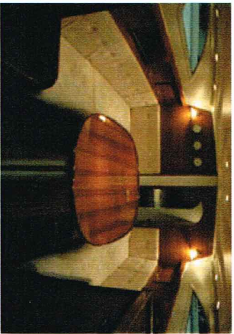
The classic layout