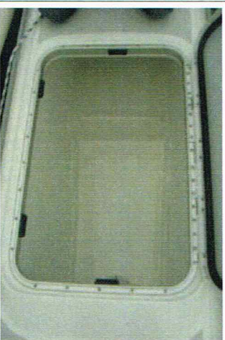
Huge volume of the floatz makes for good stowage