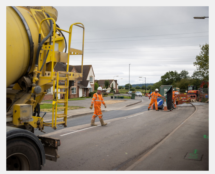
In Nailsea, we're working very close to peoples' homes

When working on the public highways we need to manage traffic to keep everyone safe. We recognise the disruption our roadworks are causing and we are working closely with Murphy to reduce this as best we can.