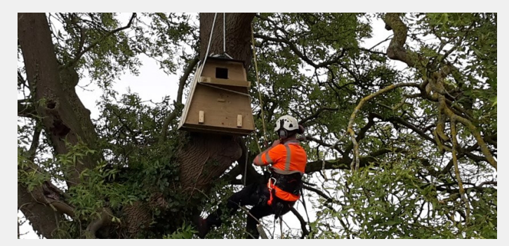
Installing owl boxes in Portbury Wharf Nature Reserve

• A £20,000 community grant award to Bristol Avon Rivers Trust and Somerset Wildlife Trust's year-long study into the effect of American Mink on native water vole populations in Somerset.