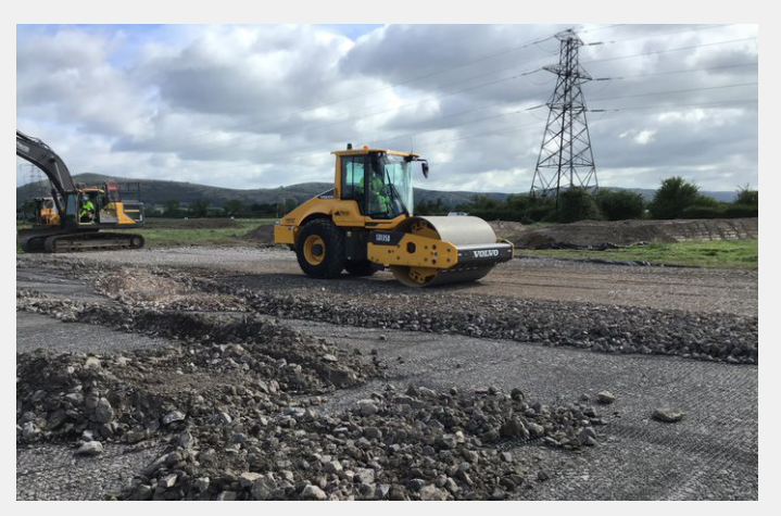
Once we've completed the road accesses, we start to build the construction haul road

We recognise this work will cause delays to journeys and we're sorry for any inconvenience. We're working closely with our contractor, Balfour Beatty, to reduce disruption as best we can and aim to complete the roadworks as quickly as possible.