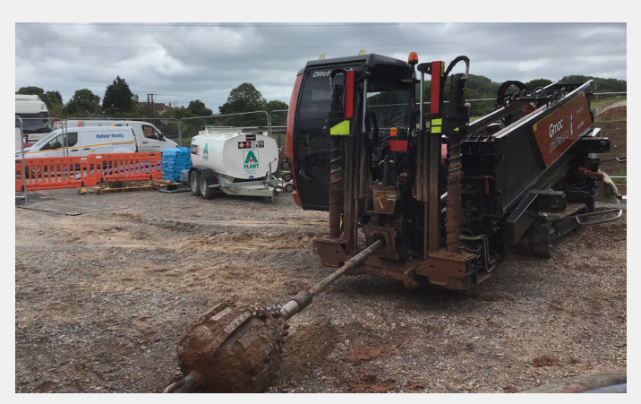
HDD machine for drilling under roads and rivers

We are now installing underground cable ducts and joint bays. For the majority of the route we will dig trenches for the ducts. In sensitive areas, including under main roads, we will use horizontal directional drilling (HDD) to push the ducts through the ground.