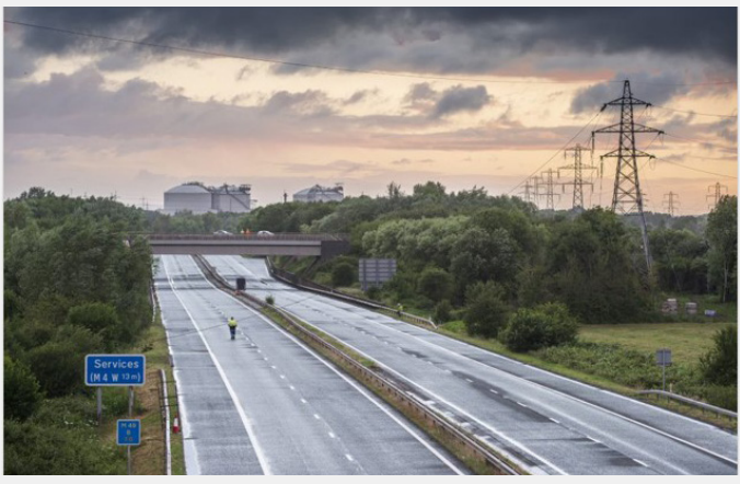
Taking down pylons over M49

Ever wondered how pylons are taken down? Read more on page 7.