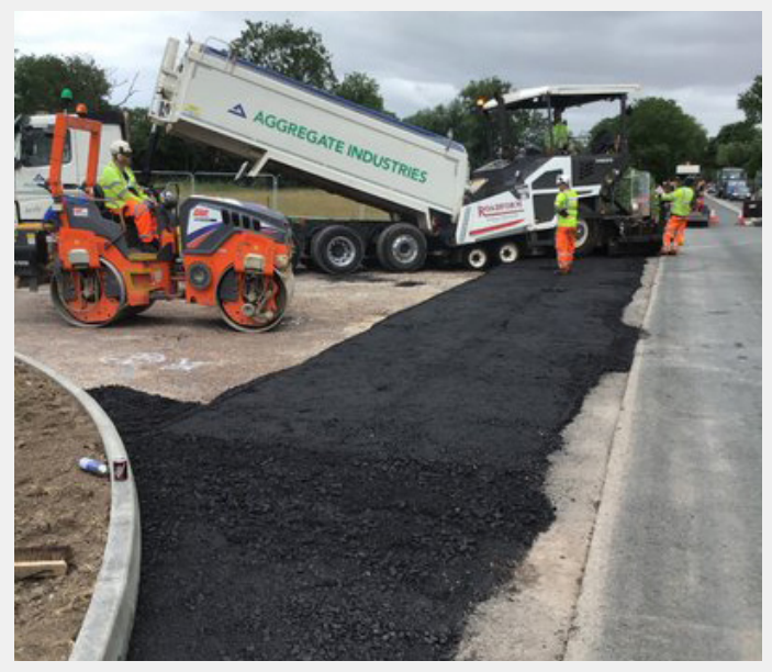
We've completed work to build the road access south off A38

We've already completed work to build a road access south off the A38 near Rooks Bridge and on Causeway in Woolavington.