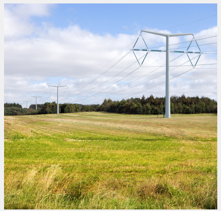
We will use T-pylons for most of the route

As the works progress, we'll provide more information on the construction programme.