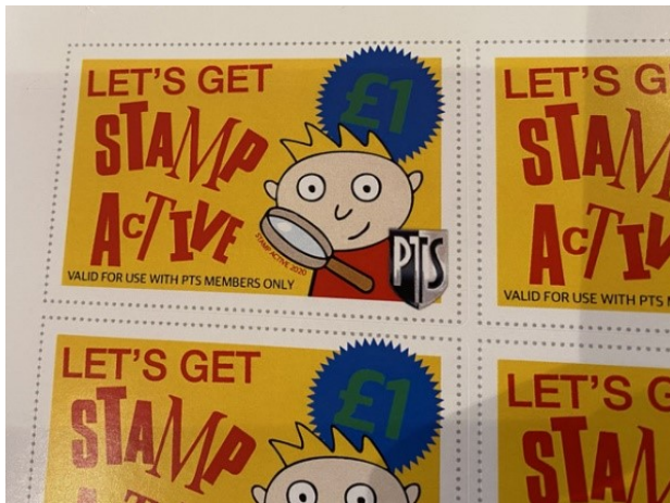
£20 in Vouchers

100 youngsters will receive a £20 in vouchers to spend with dealers at the Show.