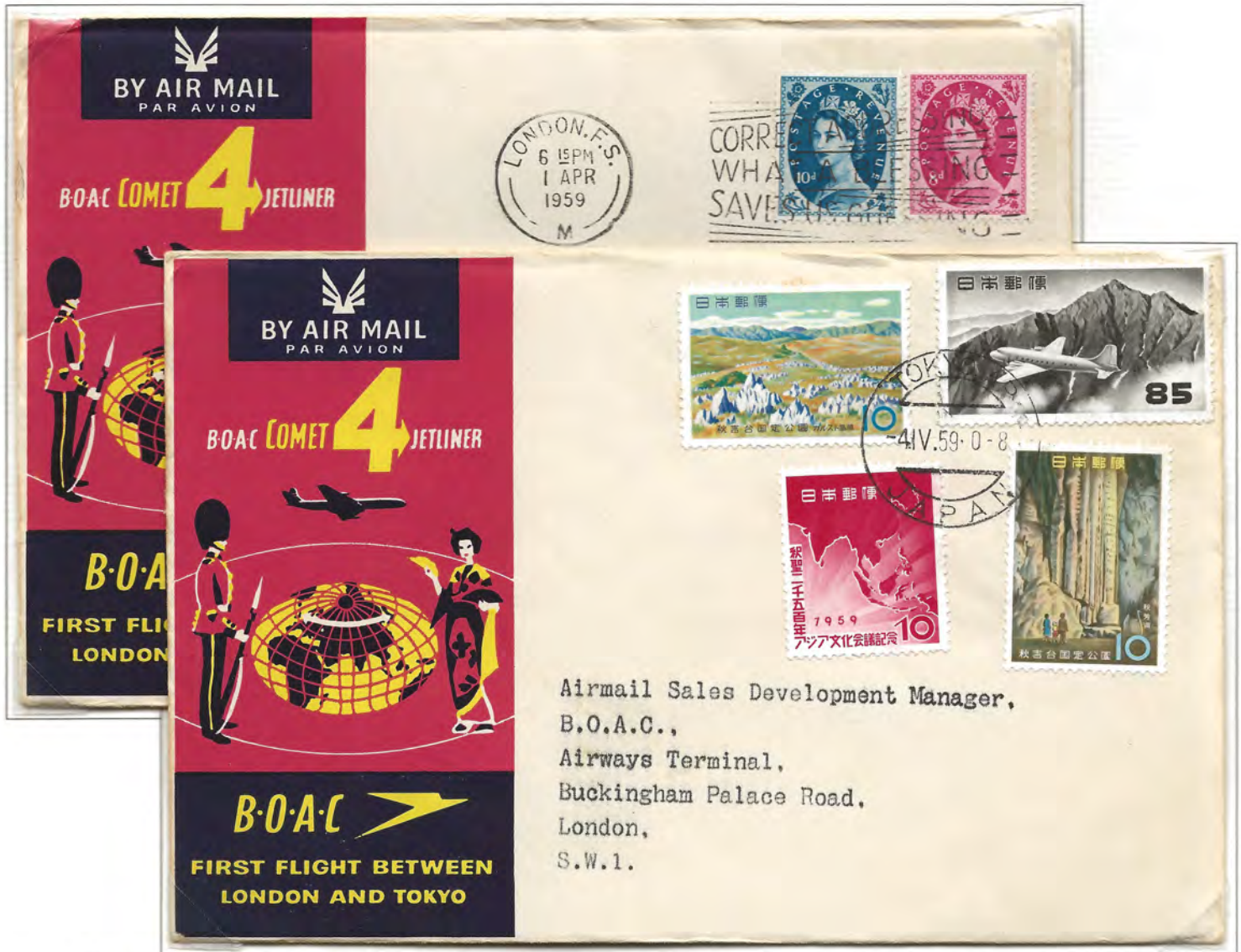
Figure 4: BOAC Comet 4 First Flight Covers, London - Tokyo & Tokyo - London (April '59)

Testing took place at de Havilland and the Royal Aircraft Establishment in Farnborough. It was concluded that the cause of both accidents was cracks in the fuselage, propagating from the stress points at the corner of one of the square windows due to metal fatigue. Comet 2s, which were used by the RAF, had oval windows, a thicker fuselage skin, more powerful Rolls Royce engines and were slightly longer. The two Comet 3 prototypes were longer still and with larger wings and uprated engines formed the basis of the Comet 4 series. The Comet 4C was introduced on long distance routes such as London to Tokyo in 1959 (Fig. 4), replacing the slower turbo-prop aircraft, e.g. the Bristol Britannia, which had been used during the interim. However, by this time the Boeing 707 had entered service, lessons having been learnt from the UK's experience. It became the preferred aircraft, particularly on the competitive and lucrative North Atlantic route. The UK's lead had been lost.