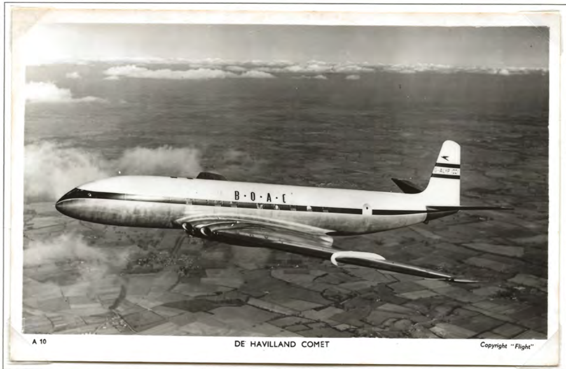
Figure 1: BOAC De Havilland Comet in Flight

The Comet (Fig. 1) was first commercial jet airliner in the world and a response to one conclusion of the Brabazon Committee established in 1943. Designed and built by de Havilland as DH106 at Hatfield the prototype first flew on 27 July 1949, well ahead of its main rivals. The Comet entered commercial service with the British Overseas Aircraft Corporation (BOAC) on 2 May 1952 (Fig. 2).