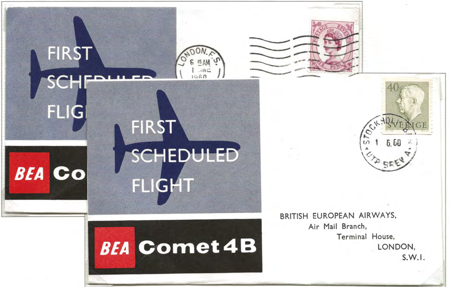
Figure 5: BEA Comet 4B First Flight Covers, London - Stockholm & Stockholm - London (June '60)