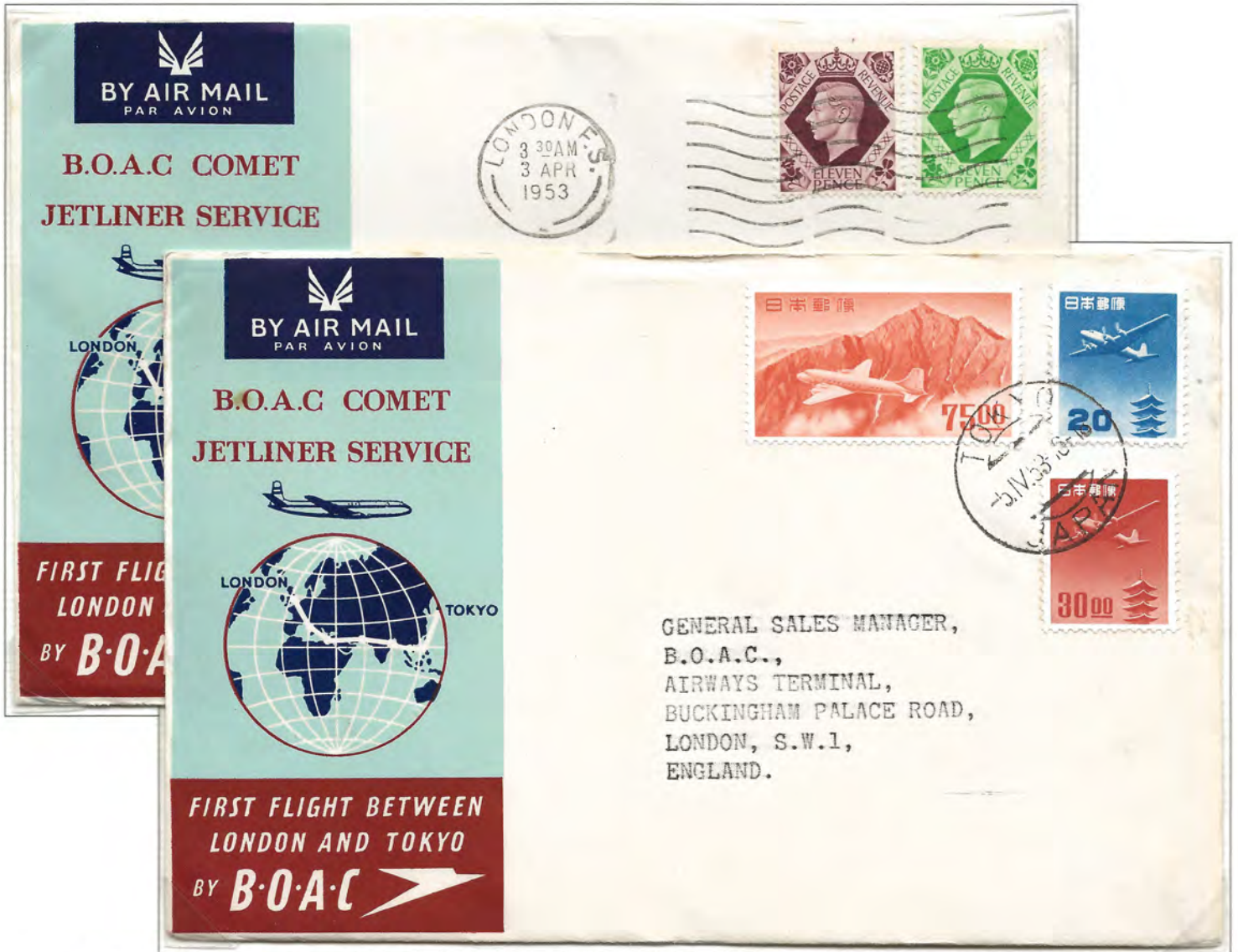
Figure 3: BOAC Comet First Flight Covers, London - Tokyo & Tokyo - London (April '53)

The Comet was introduced on many of BOAC's international routes during 1952/3, e.g. London to Tokyo (Figure 3). Then on 10 January 1954 BOAC Comet (G-ALYP) crashed into the sea south of Elba during a scheduled flight from London to Singapore. All 29 passengers and six crew lost their lives. The following day BOAC suspended all its Comet passenger flights while all aircraft were inspected and the accident investigated. By 23 March 1954, modifications had been made and Comet passenger flights resumed on the Johannesburg service with others to follow. However, on 8 April 1954 BOAC Comet (G-ALYY) under charter by South African Airways with a crew of seven and 14 passengers on board broke up over the Mediterranean near Naples. A few days later, its UK Certificates of Airworthiness were withdrawn pending further detailed investigation.