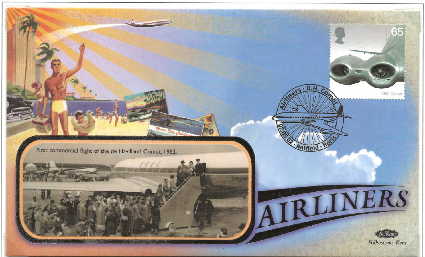
Figure 2: British Aircraft 65p Value on Cover Commemorating the First Commercial Comet Flight

The Comet (Fig. 1) was first commercial jet airliner in the world and a response to one conclusion of the Brabazon Committee established in 1943. Designed and built by de Havilland as DH106 at Hatfield the prototype first flew on 27 July 1949, well ahead of its main rivals. The Comet entered commercial service with the British Overseas Aircraft Corporation (BOAC) on 2 May 1952 (Fig. 2).