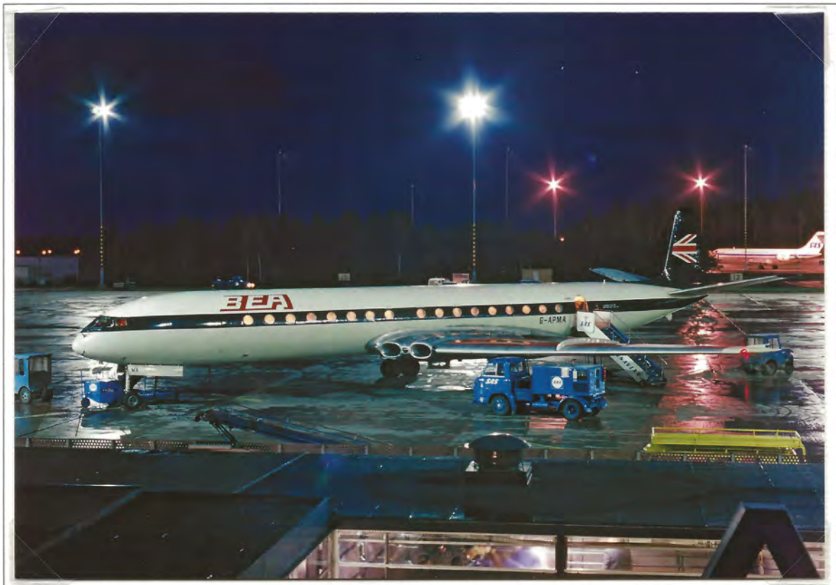
Figure 6: BEA Comet 4B G-APMA at Stockholm Airport (Oct '70)