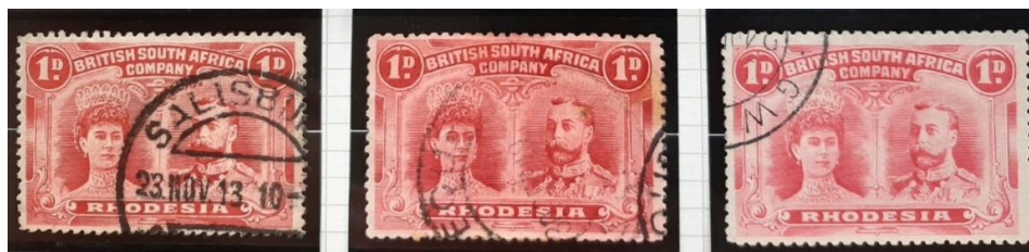
1d bright carmine (SG123), 1d carmine-lake (SG124) & 1d rose-red (SG125)

The Rhodesia Double Heads are works of art and some of my favourite stamps. All the values have the same design, comprising side-by-side portraits of Queen Mary and George V, and were issued from 11 Nov 1911 to 1913. They were printed by Waterlow. in four groups with perfs. P14, P15, P14x15/P15x14 & P13 1 / 2 . The 1 / 2 d, 1d, 2d & 2 1 / 2 d values are monochrome, while the values from 3d to £1 are printed in two colours and most exist in several shades, as indicated below for the 1d.