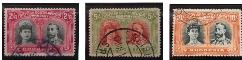
2/6 black & rose carmine (SG157), 5/- scarlet & pale yellow-green (SG160) and 10/- deep myrtle & orange (SG163)

I am very much an amateur in this area, concentrating on those stamps listed by Stanley Gibbons, some of which are shown below. I will have to wait for a significant lottery win to fill the numerous gaps in my collection.