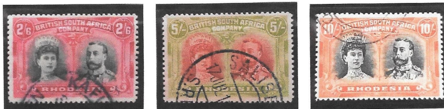
2/6 black & rose carmine (SG157), 5/- scarlet & pale yellow-green (SG160) and 10/- deep myrtle & orange (SG163)

I am very much an amateur in this area, concentrating on those stamps listed by Stanley Gibbons, some of which are shown below. I will have to wait for a significant lottery win to fill the numerous gaps in my collection.