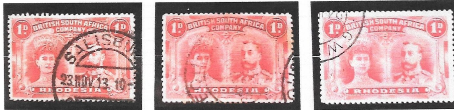
1d bright carmine (SG123), 1d carmine-lake (SG124) & 1d rose-red (SG125)

The Rhodesia Double Heads are works of art and some of my favourite stamps. All the values have the same design, comprising side-by-side portraits of Queen Mary and George V, and were issued from 11 Nov 1911 to 1913. They were printed by Waterlow. in four groups with perfs. P14, P15, P14x15/P15x14 & P13 1 / 2 . The 1 / 2 d, 1d, 2d & 2 1 / 2 d values are monochrome, while the values from 3d to £1 are printed in two colours and most exist in several shades, as indicated below for the 1d.