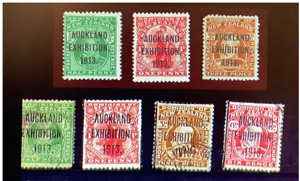
Example of New Zealand forged overprints.