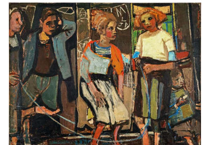
"Skipping" by Joan Eardley c.1950

Art expresses an individual, but also defines a society, its history, social events, perceptions and ideals. WDC has works that record local development in time and community and also procures significant works from further afield from which we can learn and enjoy. The fascinating collection of fine art by local and nationally important artists spans 300 years. This talk brings the collection to life through little known stories of the paintings and the artists who created them.. [Preceded by the AGM].