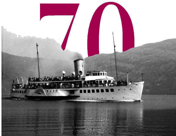
The Maid of the Loch turns 70 in 2023.

http://www.spanglefish.com/explorewestdunbartonshire/index.asp