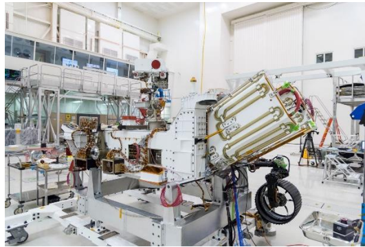
Power for Mars 2020: The electricity for NASA's Mars 2020 rover is provided by a power system called a Multi-Mission Radioisotope Thermoelectric Generator, or MMRTG. The MMRTG will be inserted into the aft end of the rover between the panels with gold tubing visible at the rear, which are called heat exchangers.