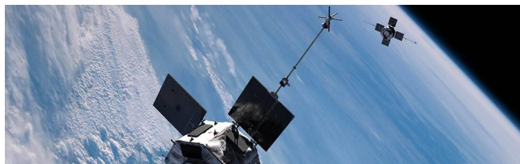
Van Allen Probe.

As expected, following final de-orbit manoeuvres in February of this year, the spacecraft has used its remaining propellant to keep its solar panels pointed at the Sun and is now out of