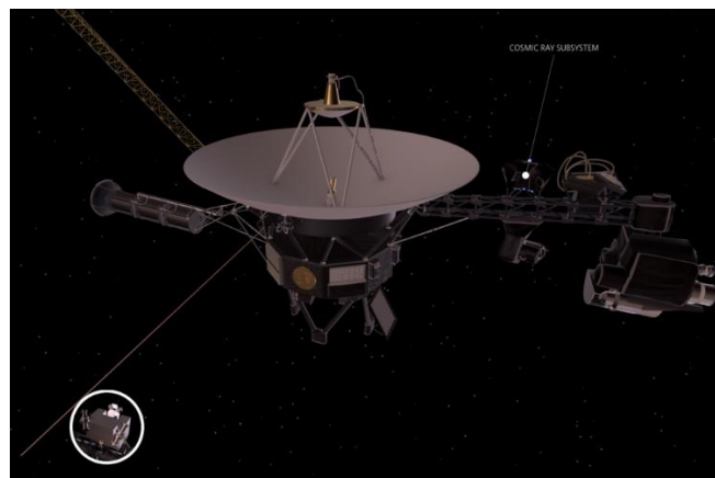
This artist's concept depicts one of NASA's Voyager spacecraft, including the location of the cosmic ray subsystem (CRS) instrument. Both Voyagers launched with operating CRS instruments.

With careful planning and dashes of creativity, engineers have been able to keep NASA's Voyager 1 and 2 spacecraft flying for nearly 42 years, longer than any other spacecraft in history. To ensure that these vintage robots continue to return the best science data possible from the frontiers of space, mission engineers are implementing a new plan to manage them. And that involves making difficult choices, particularly about instruments and thrusters. One key issue is that both Voyagers, launched in 1977, have less and less power available over time to run their science instruments and the heaters that keep them warm in the coldness of deep space. Engineers have had to decide what parts get power and what parts have to be turned off on both spacecraft. But those decisions must be made sooner for Voyager 2 than Voyager 1 because Voyager 2 has one more science instrument collecting data and drawing power than its sibling.