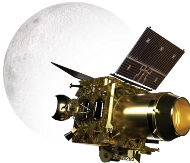
Chandrayaan-2 spacecraft.

India's Geosynchronous Satellite Launch Vehicle GSLV MkIII-M1, successfully launched the 3840 kg Chandrayaan-2 spacecraft into an earth orbit. The spacecraft is now revolving round the earth with a perigee (nearest point to Earth) of 169.7 km and an apogee (farthest point to Earth) of 45,475 km. Today's flight marks the first operational flight of the GSLV Mk III. This is the beginning of the historical journey of India towards Moon and to land at a place near south pole to carry out scientific experiments to explore the unexplored. The mission life of the Orbiter is one year, and it will be placed in a 100X100 km lunar polar orbit. (ISRO)