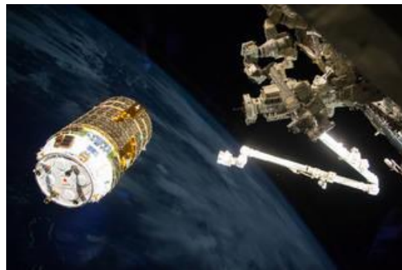
The Japan Aerospace Exploration Agency's (JAXA) unpiloted H-II Transport Vehicle-6 (HTV-6) makes its final approach to the International Space Station Dec. 13, 2016.