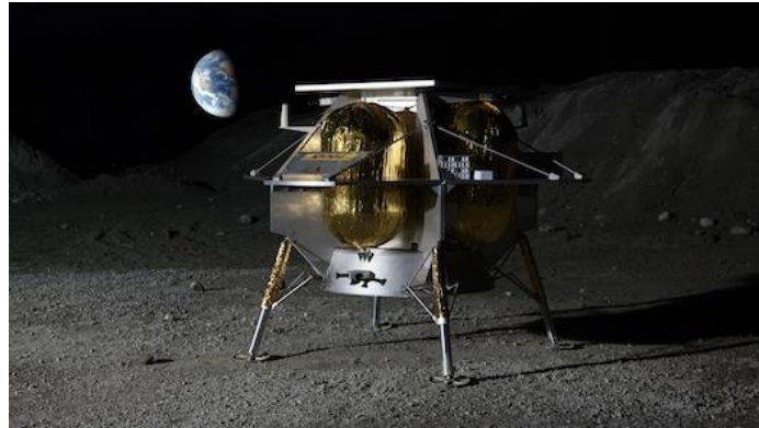
The Peregrine Lander.

Spacebit proudly announces at The UK Space Conference 2019 their signing of a joint agreement with Astrobotic to begin commercial and scientific lunar exploration with the first mission in 2021 on the Peregrine lunar lander. Astrobotic's Peregrine lunar lander will be launched on a Vulcan Centaur rocket from Space Launch Complex-41 at Cape Canaveral Air Force Station in Florida. The launch will carry the first lunar lander from American soil since Apollo. This agreement comes after Spacebit examined the field of commercial lunar delivery providers and determined Astrobotic to be the world's leading provider with one of the most technically mature lunar lander programs. With this announcement, Spacebit joins Astrobotic's existing manifest of 16-signed contracts toward Peregrine Mission One. This mission will result in the first payload from the UK to reach the Moon surface and mark the beginning of a new era in commercial space exploration for Britain. Astrobotic is very excited to bring Spacebit's first payload to the Moon. Spacebit has pioneered a captivating new way of working on the lunar surface. More details being released soon. (Spacebit) Astrobotic and Spacebit to bring the first UK commercial payload to the Moon (24 September 2019)