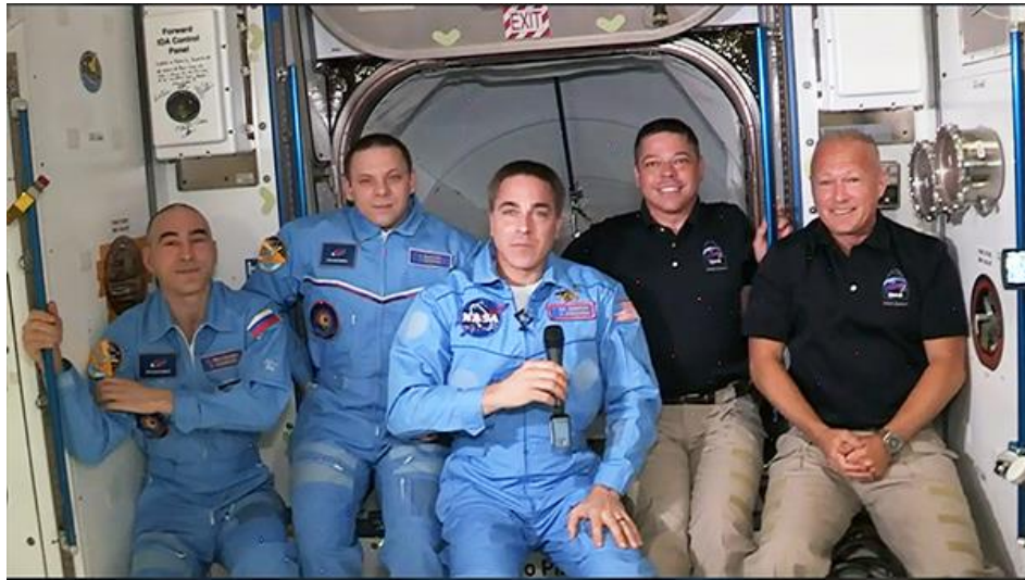
The Expedition 63 crew has expanded to five members with the arrival of the SpaceX Crew Dragon. (From left) Anatoly Ivanishin, Ivan Vagner, Chris Cassidy, Bob Behnken and Doug Hurley.