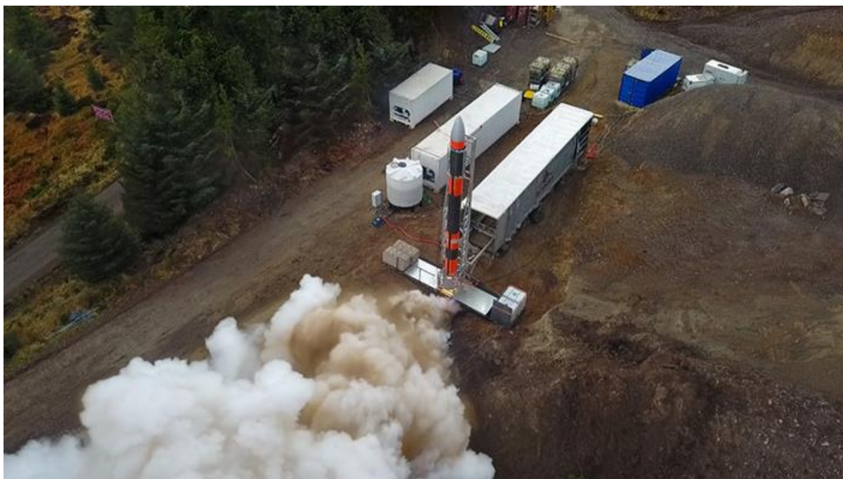
The Skyrora Skylark-L rocket undergoes its first vertical static fire test in the Scottish Highlands

Skyrora makes history as it completes UK's largest rocket fire test in 50 years. A full-size rocket has successfully carried out all actions needed to reach space, in the first vertical static fire test of its magnitude in the UK for 50 years. Scottish firm Skyrora said the Skylark-L rocket, the first of its kind since the Black Arrow programme, could be ready to launch from British soil as early as spring 2021, although the required spaceport infrastructure is not expected to be ready by then. "We see this as being the first significant step towards reaching