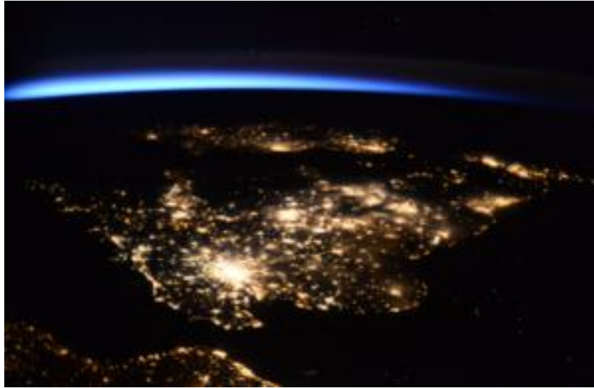
A picture of United Kingdom under aurora taken by ESA astronaut Tim Peake during his six-month Principia on the International Space Station.

First UK space census is launched, surveying the diversity of the UK space sector and collecting insights to inform future space policy. The 2020 Space Census will collect, for the first time, anonymous information from space sector professionals to build a comprehensive picture of the UK space job market; covering demographic characteristics from age and gender to race and sexuality. Once complete, the Space Growth Partnership, a network of government, industry and academia that informs national space policy and sector strategy, will use this intelligence to develop actions to improve equality, diversity and inclusion in the UK space sector. The UK space sector is aiming to create 30,000 new jobs in the coming decade and this ambition relies on it having a highly-skilled and diverse workforce, with jobs from satellite builders and rocket scientists to accountants and business development managers.