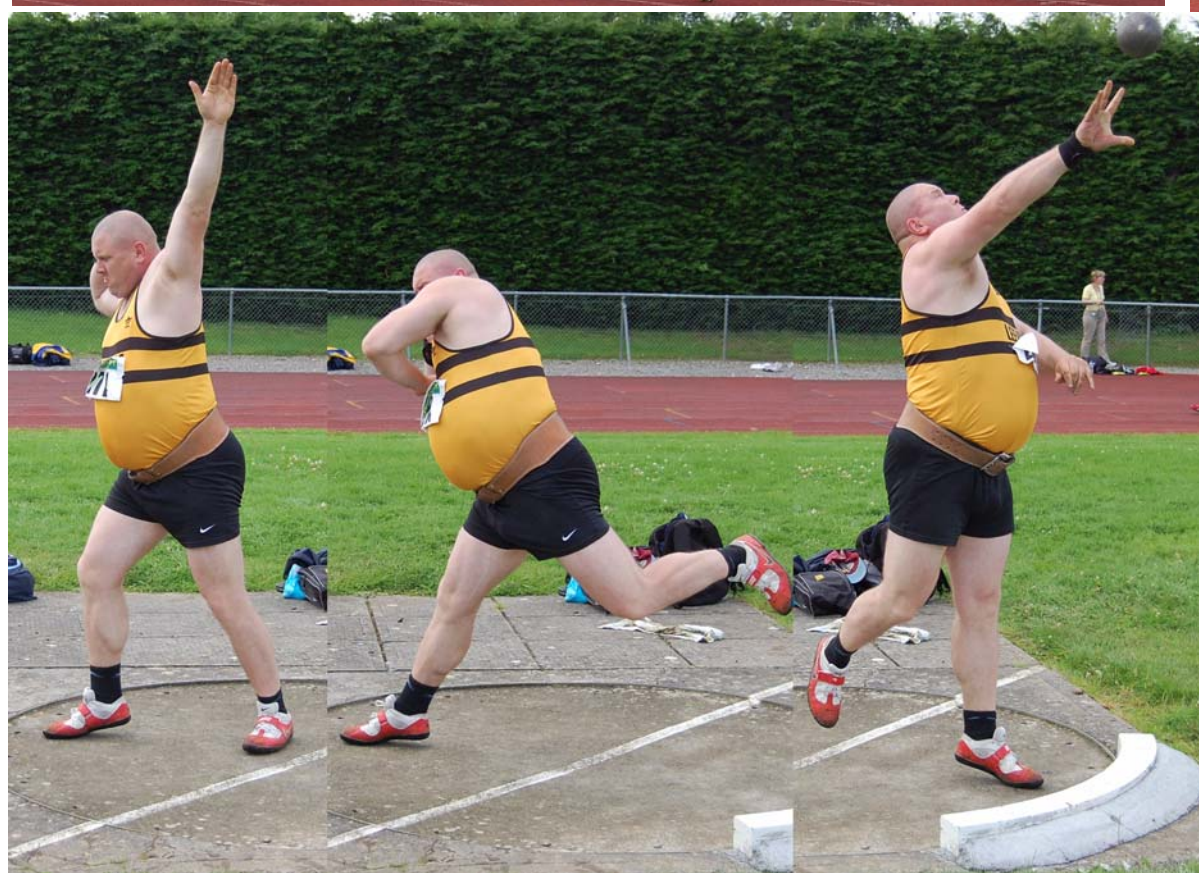
Action from Tullamore, July 2008: Masters T&F