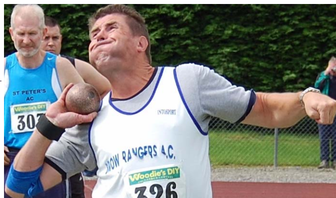
Tullamore shot putter, Masters T&F, 2008

Please see www.wma2009.org . Entries close 17th May 2009.