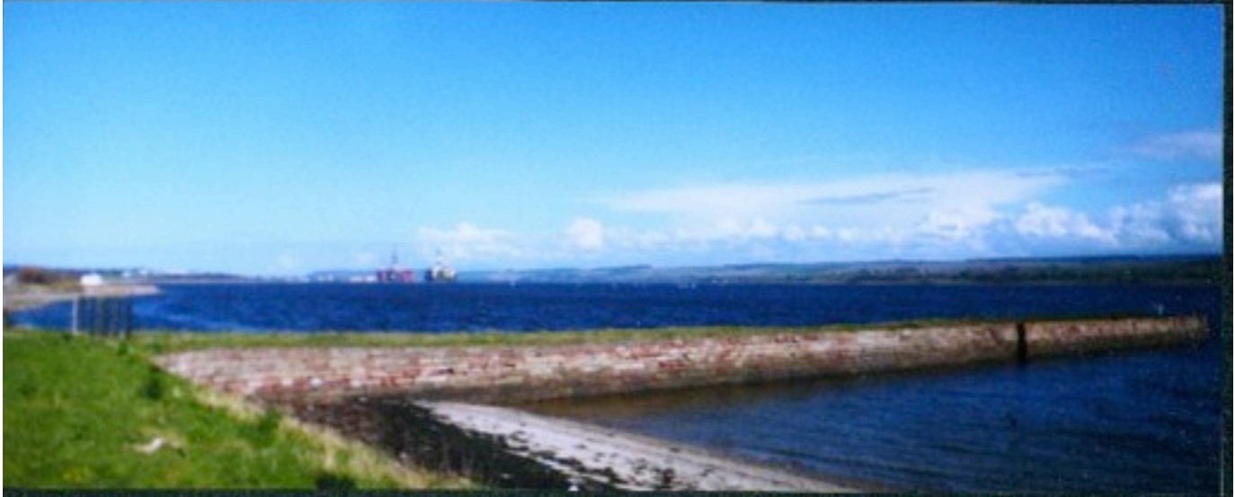
These photographs are of Belleport House and the pier opposite.