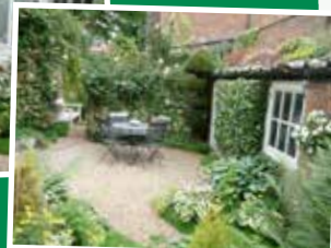
Pictured above is one of Hurworth's hidden gems, The Courtyard Garden.