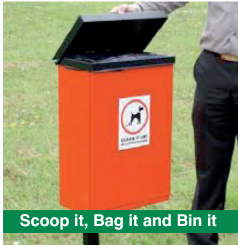
Scoop it, Bag it and Bin it