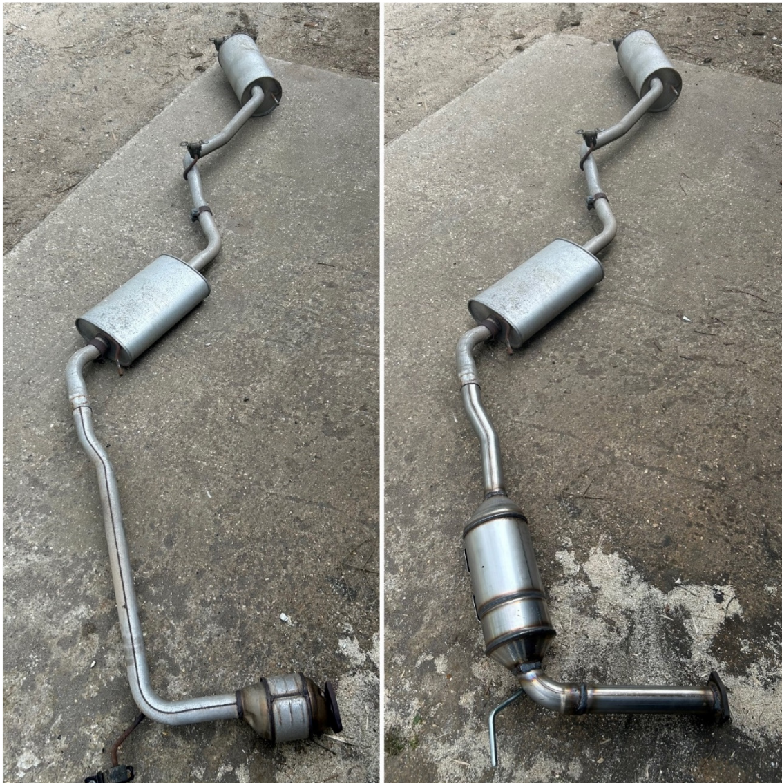
Complete exhaust system on the ground. With original catalyst (left), and with DPF (Right)

To replace the original catalyst with the DPF, the catalyst should be disconnected from the 3-bolt flange near the engine. The bolts can be very corroded, and heating and cutting can be necessary. And it should be disconnected in the assembly with the rear part of the exhaust system with the 2 silencers, which can also be difficult to disassemble. It might be easiest and fastest to uninstall the complete exhaust system, and work with that on the ground. See photo below.