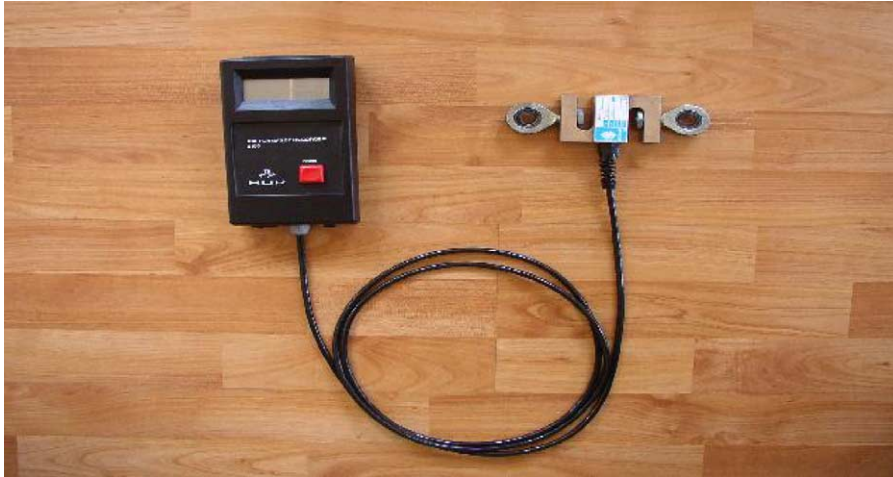
Picture 1. The HUR Performance Recorder 8100 (PR 8100) TM connected to the Celtron STC-500 kg Force Transducer TM used for cervical muscle testing.

harness and pulley (Picture 2). The aim of this exercise was to maximally load the side flexors via movement of the dynamometer lever arm whilst the player kept their head and neck in neutral. The system has a patient cut out switch that suspends the dynamometer action when pressed as an additional safety measure.