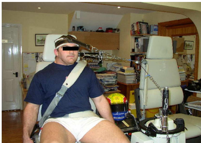
Picture 2. The player using the dynamometer to stimulate IVMCmax for right side flexion.

The Cervical 1RM test was repeated at the end of Phase 2 (Fig. 2) which showed improvement in all directions. It was interesting to note the significant improvement on left side flexion. Player A on initial pre-injury testing was stronger on the left side, which may be related to his position in the scrum as a loose head prop. Following injury, the left C8 nerve root was compromised causing muscular weakness. However, once this neural