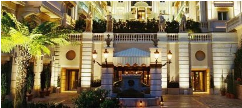
Metropole Hotel 5*