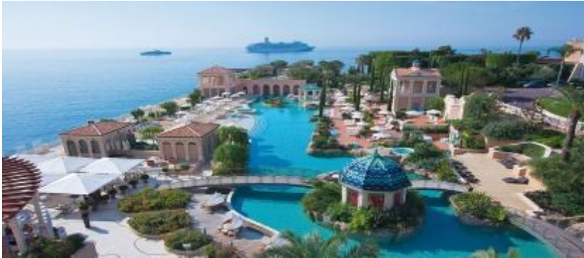
Monte Carlo Bay 4*