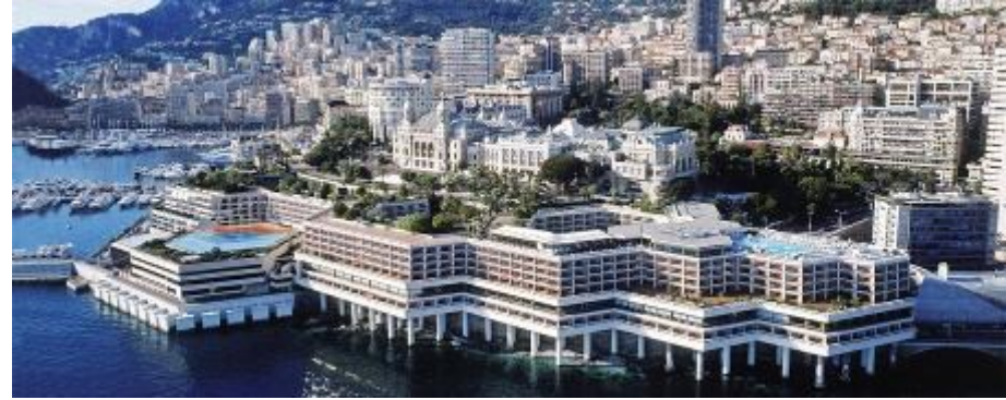
Fairmont Hotel 4*