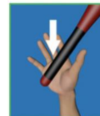
How to hold a bat.