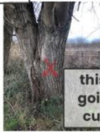
this tree is going to be cut down