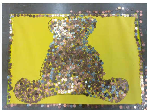
Pudsey covered in your donated change!

Children in need: Thank you for the donations towards Children in Need. There have been some very spotty children and adults in school today. We have raised £96.94.