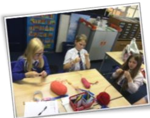
Full of concentration at knitting club!