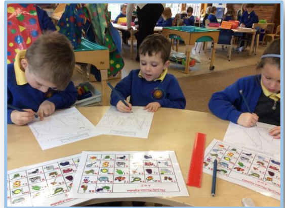
It's dinosaur week in Reception. Rooooaarr!