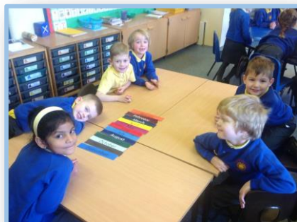
Year 1 have been learning the months of the year this week.

If you would like any help with the application, please call the school office where somebody will be able to help you.