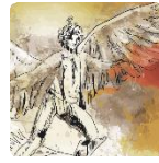
Gods and Mortals