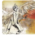
Gods and Mortals