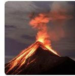
Rocks, Relics & Rumbles