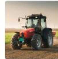
Sow, Grow and Farm