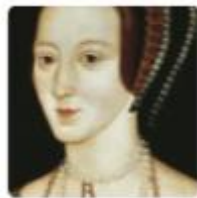
Off with Her Head!