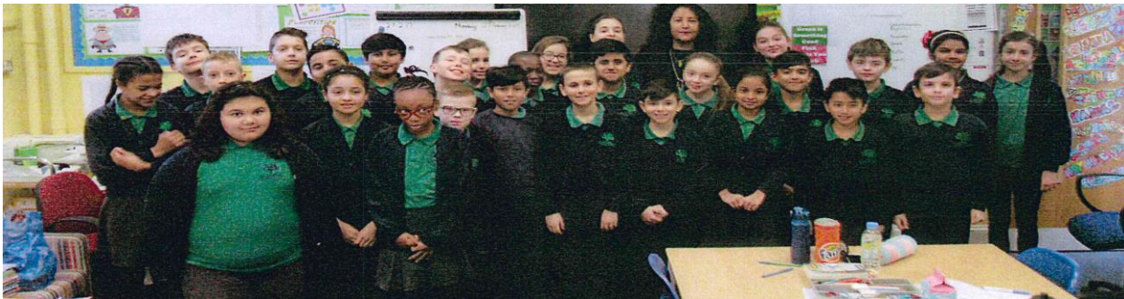
Yr6 & Yr2