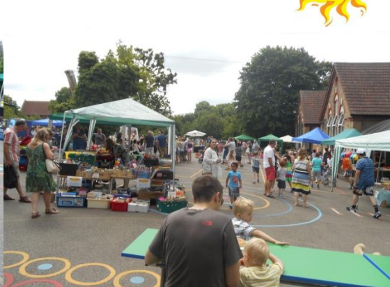
Lots of fun activities!