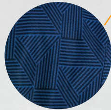
> Navy print contrast fabric