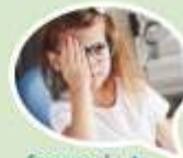
Concerns about hearing or vision