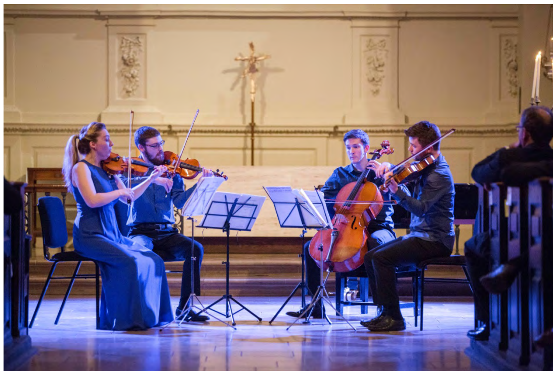
Zelkova Quartet, Chamber Music Competition Winners