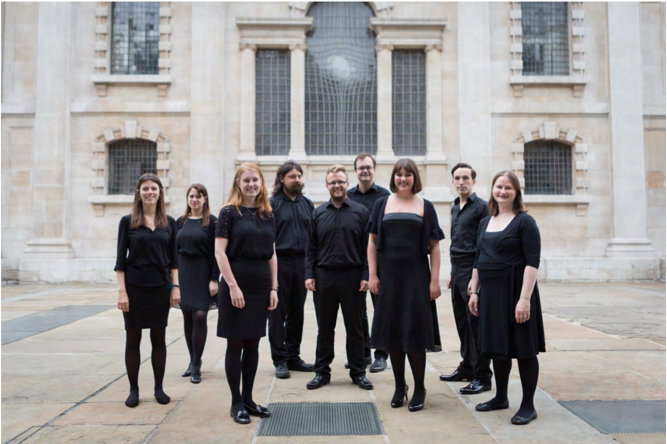
St Martin's Voices