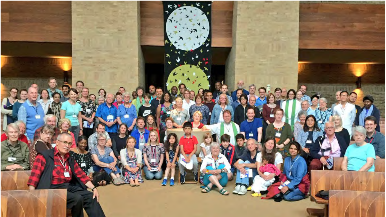
Parish Weekend, Worth Abbey

Congregational, charitable and cultural life all remain strong. There is every reason to hope and trust that congregational worship, education, fellowship and mission will continue to deepen and broaden in the year to come. Patterns of worship and formation are always under review in our effort to serve and attract our various constituencies of locals, visitors, tourists, and those experiencing trouble, distress or exclusion. Commercial operations had a more challenging year and conversations about future business developments and initiatives are alive and active. The development of choral music is exciting and highly promising, and has borne considerable fruit in establishing a distinctive St Martin's 'brand' of classical music and presentation. Our digital broadcasting continues to grow and offer opportunities for people from around the world to join in our worship and lecture programmes. Relationships with the BBC go from strength to strength.