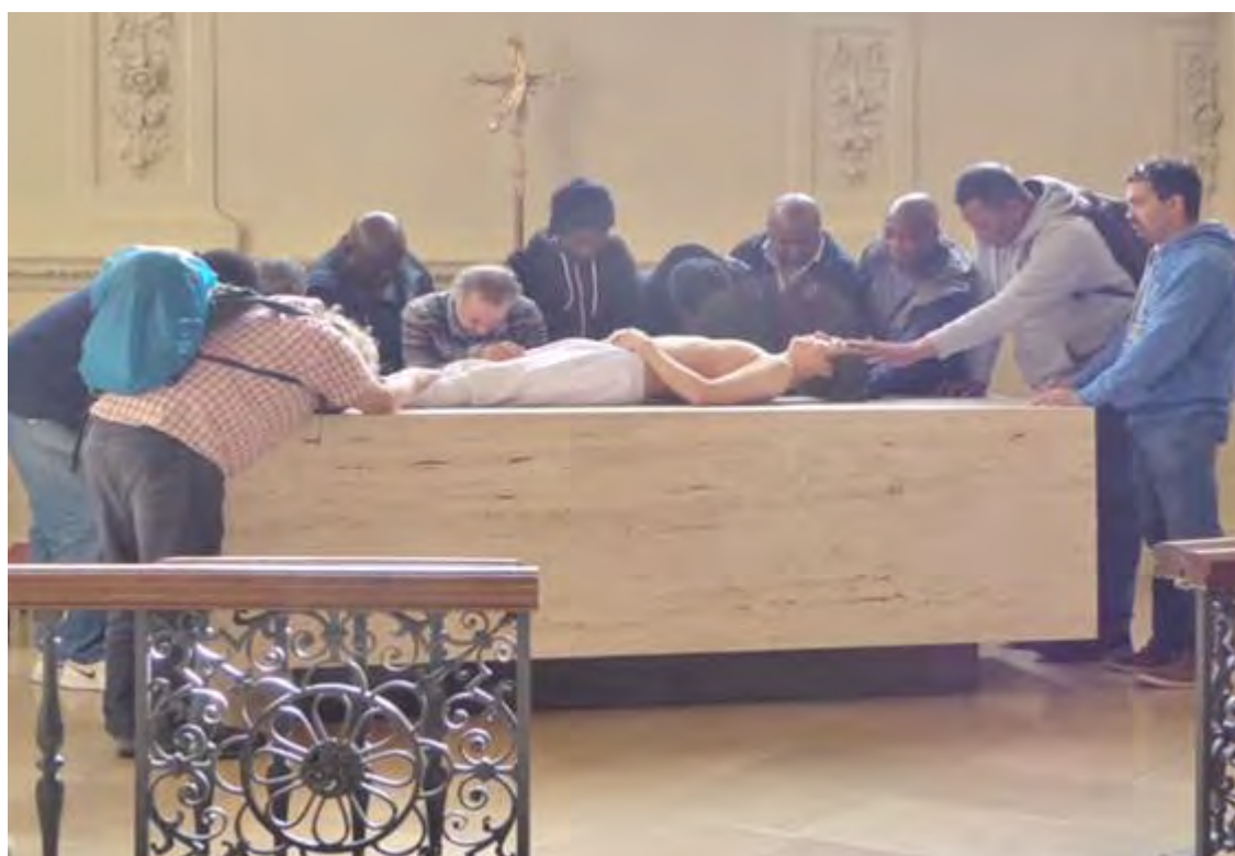
Sunday International Group in the Palm Sunday Passion Drama