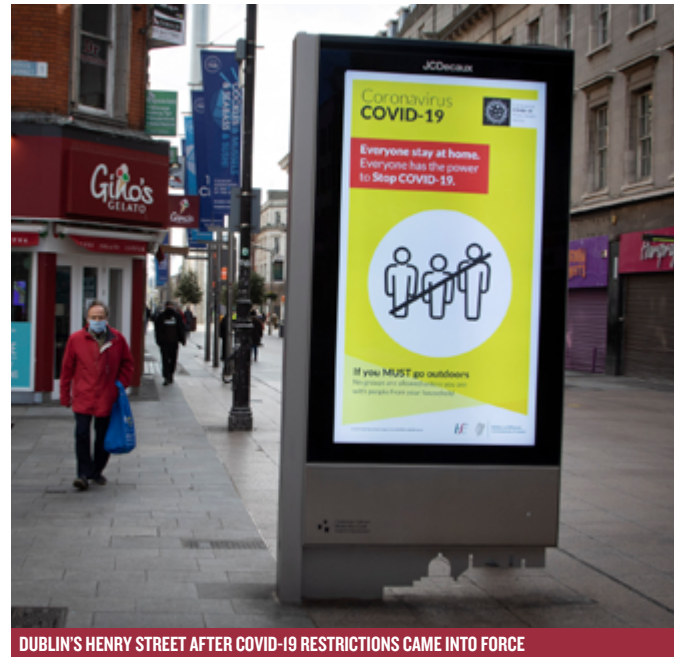
DUBLIN'S HENRY STREET AFTER COVID-19 RESTRICTIONS CAME INTO FORCE